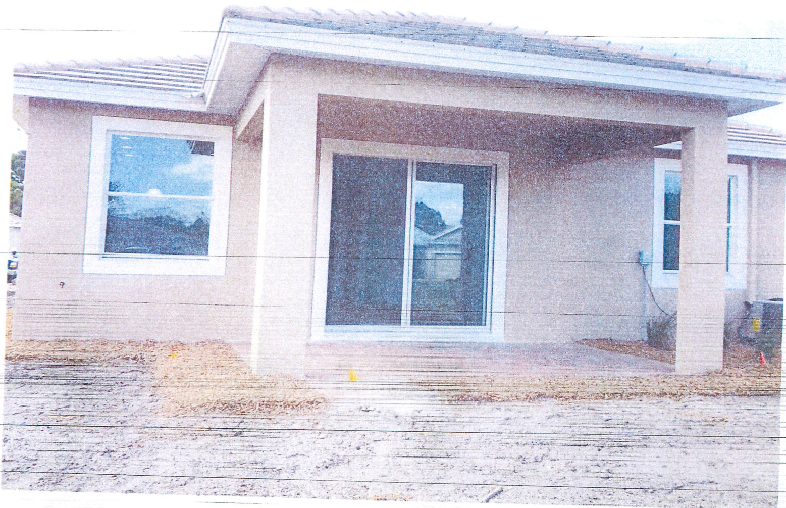
REAR VIEW (12/13/12)

If submitting more photographs than will fit on the preceding page, affix the additional photographs below. Identify all photographs with: date taken; "Front View" and "Rear View"; and, if required, "Right Side View" and "Left Side View."