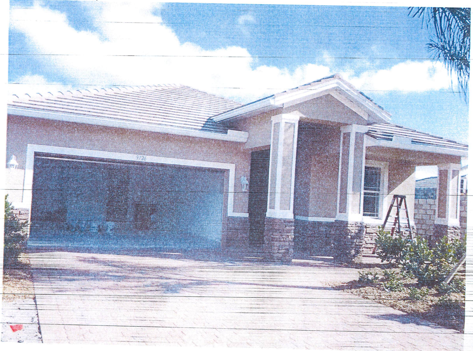
FRONT VIEW (12/13/12)

If using the Elevation Certificate to obtain NFIP flood insurance, affix at least two building photographs below according to the instructions for Item A6. Identify all photographs with: date taken; "Front View" and "Rear View"; and, if required, "Right Side View" and "Left Side View." If submitting more photographs than will fit on this page, use the Continuation Page on the reverse.