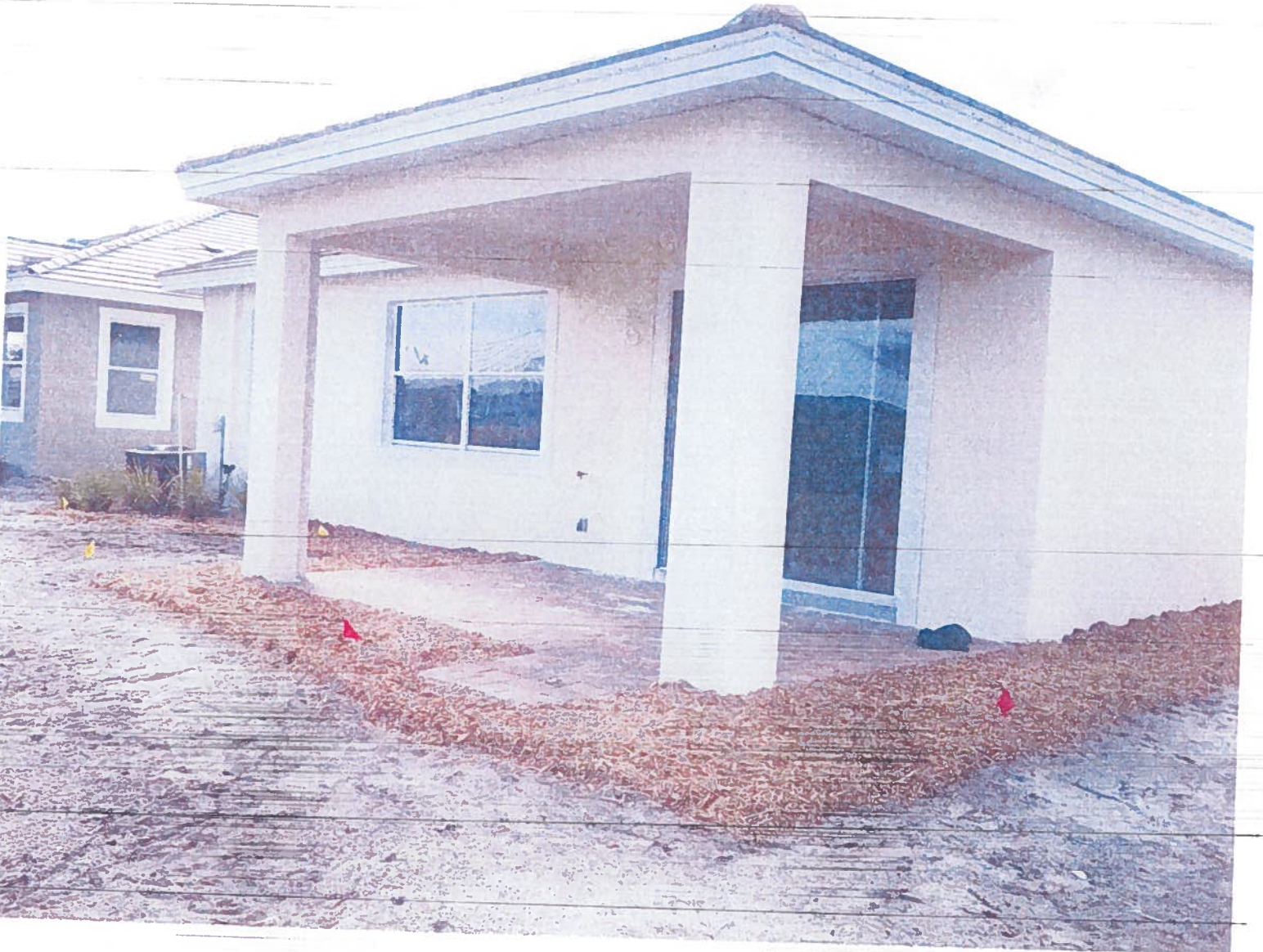
REAR VIEW (12/13/12)

If submitting more photographs than will fit on the preceding page, affix the additional photographs below. Identify all photographs with: date taken; "Front View" and "Rear View"; and, if required, "Right Side View" and "Left Side View."