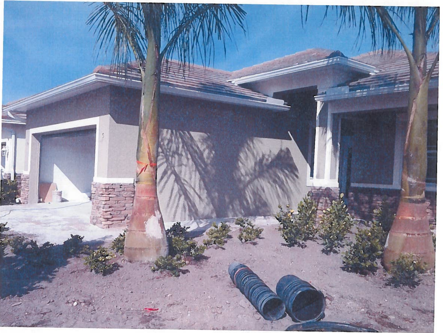
FRONT VIEW (12/1712)

If using the Elevation Certificate to obtain NFIP flood insurance, affix at least two building photographs below according to the instructions for Item A6. Identify all photographs with: date taken; "Front View" and "Rear View"; and, if required, "Right Side View" and "Left Side View." If submitting more photographs than will fit on this page, use the Continuation Page on the reverse.