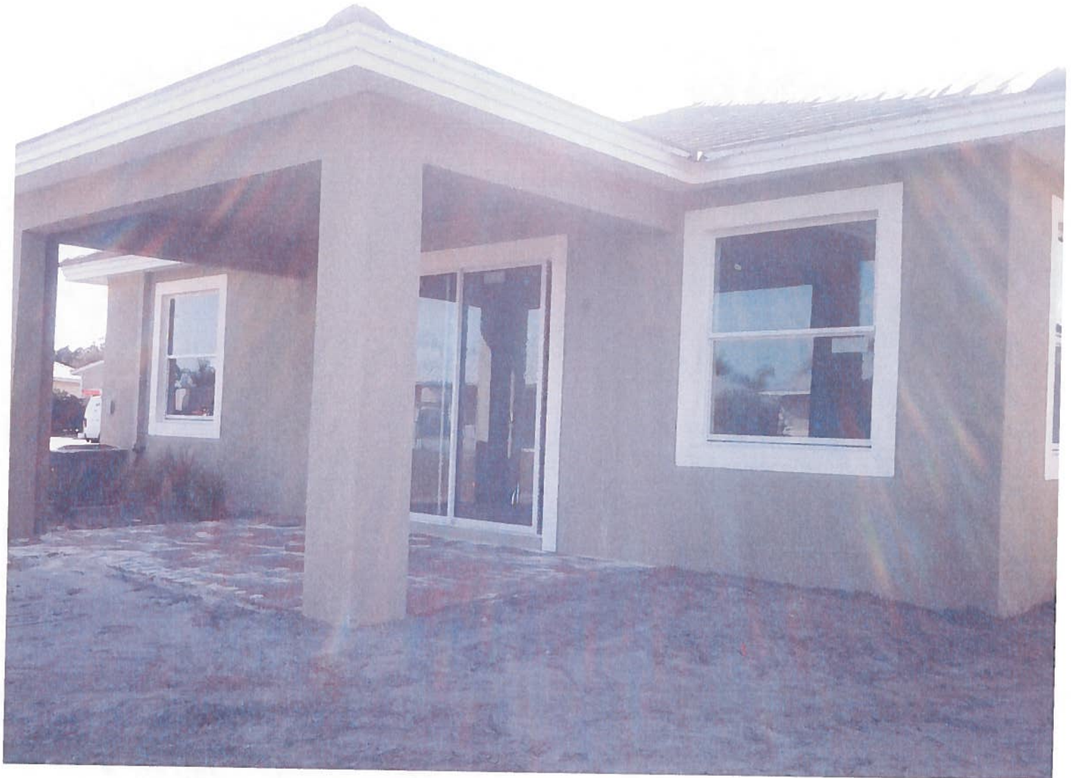
REAR VIEW (12/17/12)