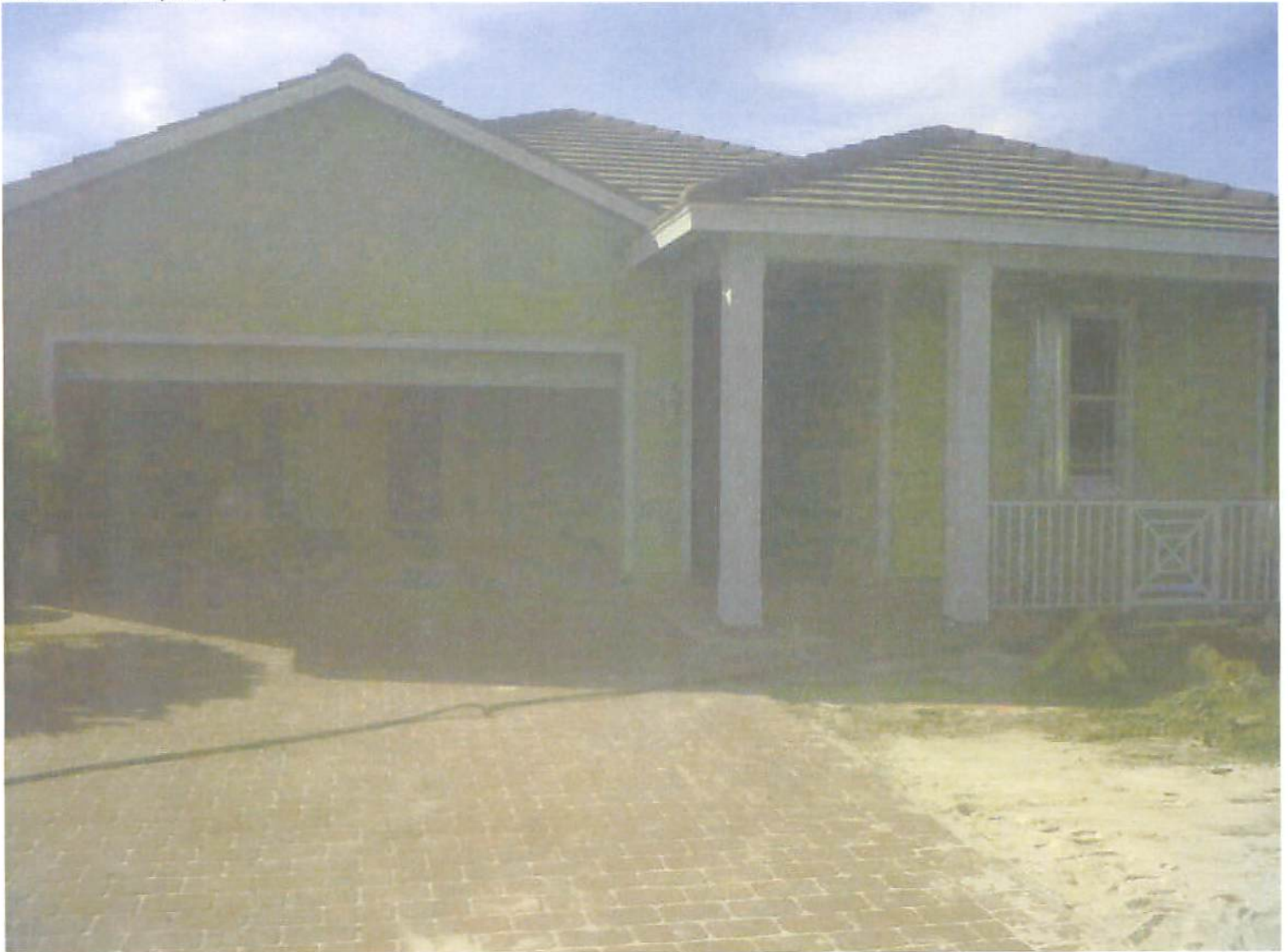
FRONT VIEW (2/4/11)

If using the Elevation Certificate to obtain NFIP flood insurance, affix at least two building photographs below according to the instructions for Item A6. Identify all photographs with: date taken; "Front View" and "Rear View"; and, if required, "Right Side View" and "Left Side View." If submitting more photographs than will fit on this page, use the Continuation Page on the reverse.