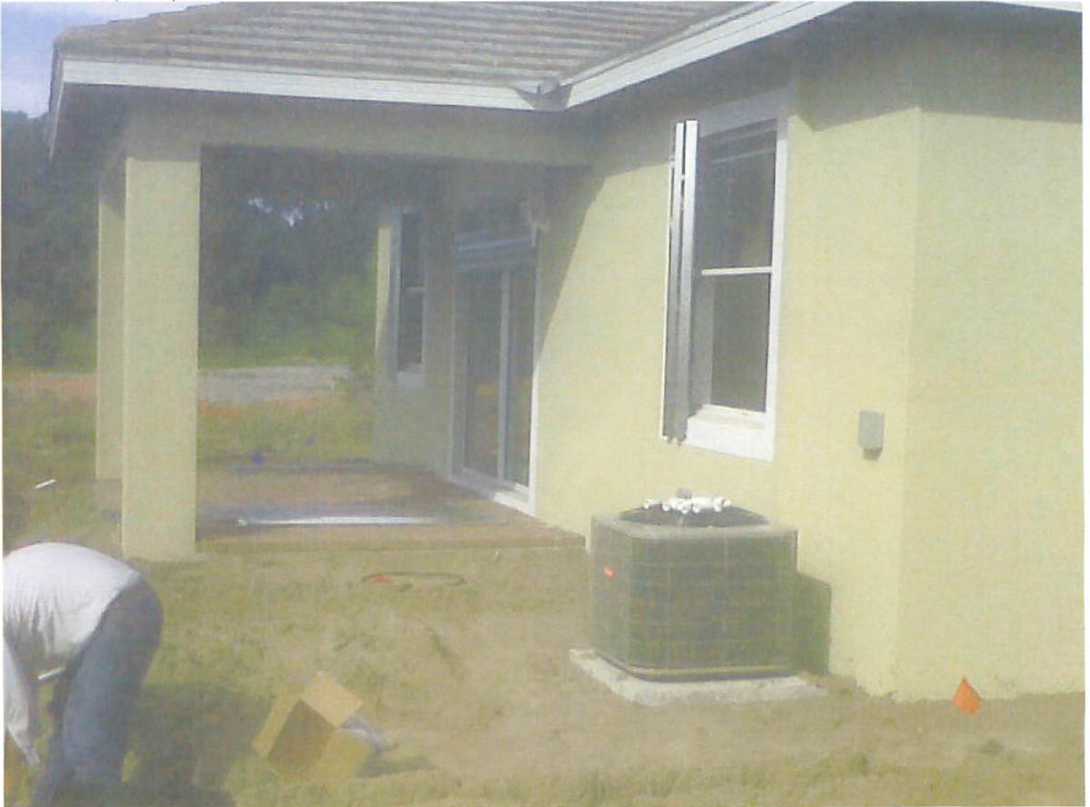
REAR VIEW (2/4/11)

If submitting more photographs than will fit on the preceding page, affix the additional photographs below. Identify all photographs with: date taken; "Front View" and "Rear View"; and, if required, "Right Side View" and "Left Side View."