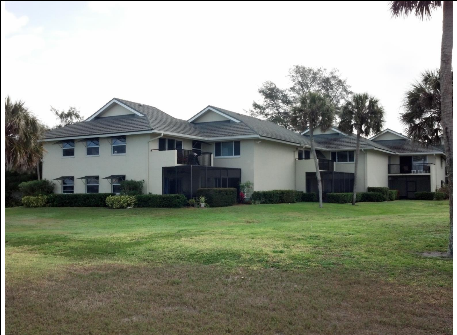
Photo taken 2/20/14Rear

If submitting more photographs than will fit on the preceding page, affix the additional photographs below. Identify all photographs with: date taken; "Front View" and "Rear View"; and, if required, "Right Side View" and "Left Side View." When applicable, photographs must show the foundation with representative examples of the flood openings or vents, as indicated in Section A8.