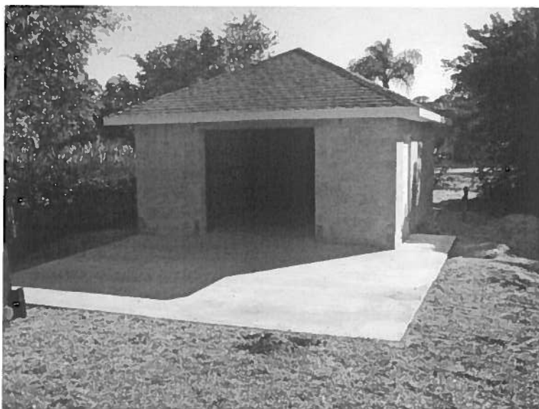
Detached Garage Front View 12/18/14

If using the Elevation Certificate to obtain NFIP flood insurance, affix at least 2 building photographs below according to the instructions for Item A6. Identify all photographs with date taken; "Front View" and "Rear View"; and, if required, "Right Side View" and "Left Side View." When applicable, photographs must show the foundation with representative examples of the flood openings or vents, as indicated in Section A8. If submitting more photographs than will fit on this page, use the Continuation Page.