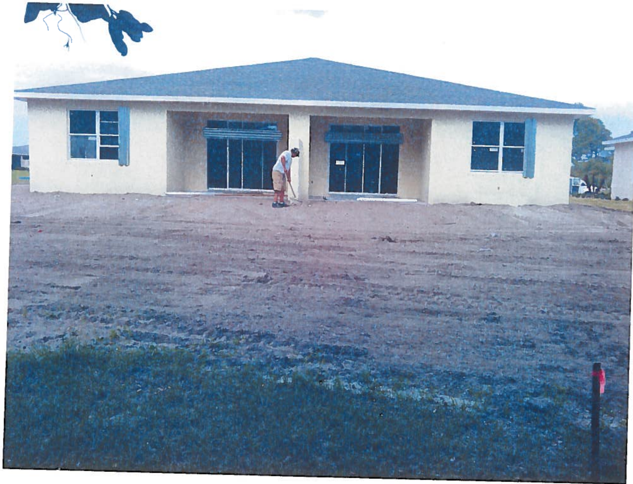
Rear Picture 4/15/2013

If submitting more photographs than will fit on the preceding page, affix the additional photographs below. Identify all photographs with date taken; "Front View" and "Rear View"; and, if required, "Right Side View" and "Left Side View." When applicable, photographs must show the foundation with representative examples of the flood openings or vents, as indicated in Section A8.