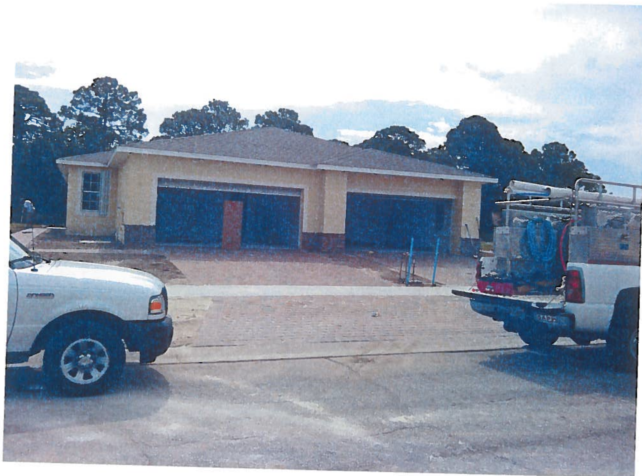
Front Picture 4/15/2013

If using the Elevation Certificate to obtain NFIP flood insurance, affix at least 2 building photographs below according to the instructions for Item A6. Identify all photographs with date taken; "Front View" and "Rear View"; and, if required, "Right Side View" and "Left Side View." When applicable, photographs must show the foundation with representative examples of the flood openings or vents, as indicated in Section A8. If submitting more photographs than will fit on this page, use the Continuation Page.