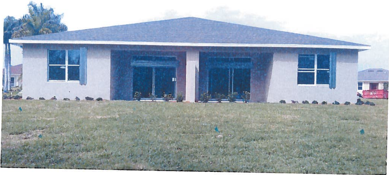
Rear Picture 4/15/2013

If submitting more photographs than will fit on the preceding page, affix the additional photographs below. Identify all photographs with: date taken; "Front View" and "Rear View"; and, if required, "Right Side View" and "Left Side View." When applicable, photographs must show the foundation with representative examples of the flood openings or vents, as indicated in Section A8.