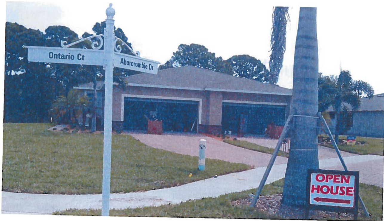
Front Picture 4/15/2013

If using the Elevation Certificate to obtain NFIP flood insurance, affix at least 2 building photographs below according to the instructions for Item A6. Identify all photographs with date taken; "Front View" and "Rear View"; and, if required, "Right Side View" and "Left Side View." When applicable, photographs must show the foundation with representative examples of the flood openings or vents, as indicated in Section A8. If submitting more photographs than will fit on this page, use the Continuation Page.