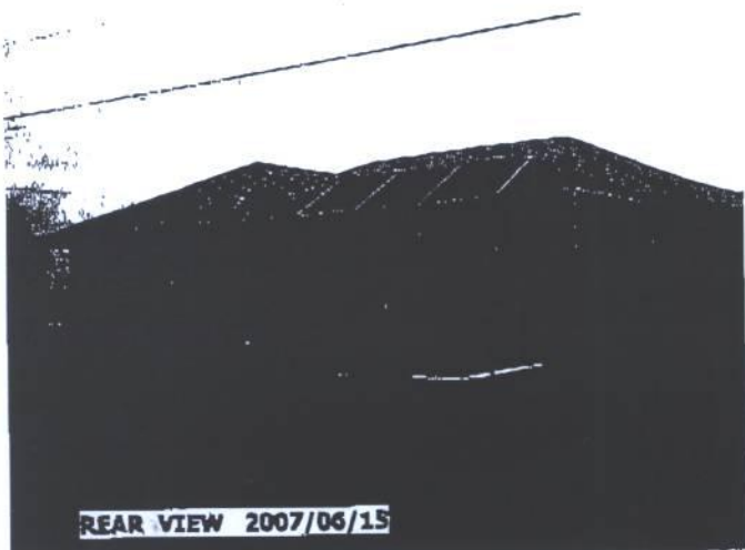
05-10-24-C JOHNNY 6-15-07.JPG