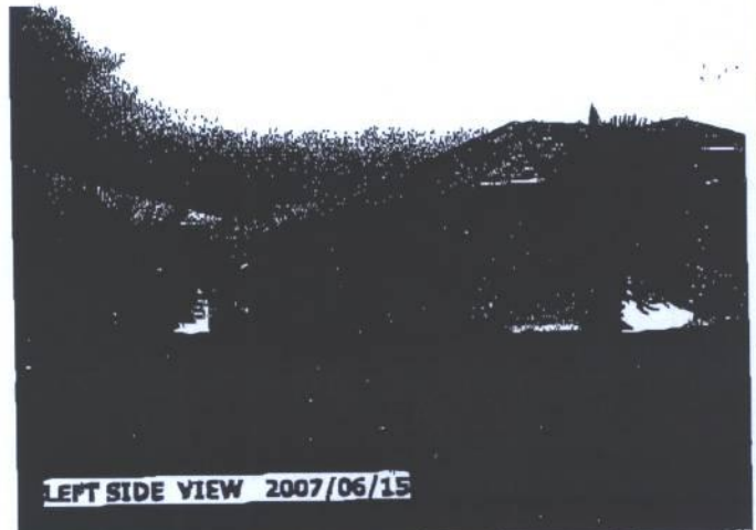
05-10-24-B JOHNNY 6-15-07.JPG