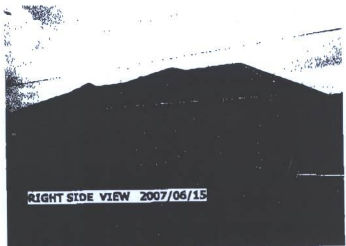
05-10-24-D JOHNNY 6-15-07.JPG