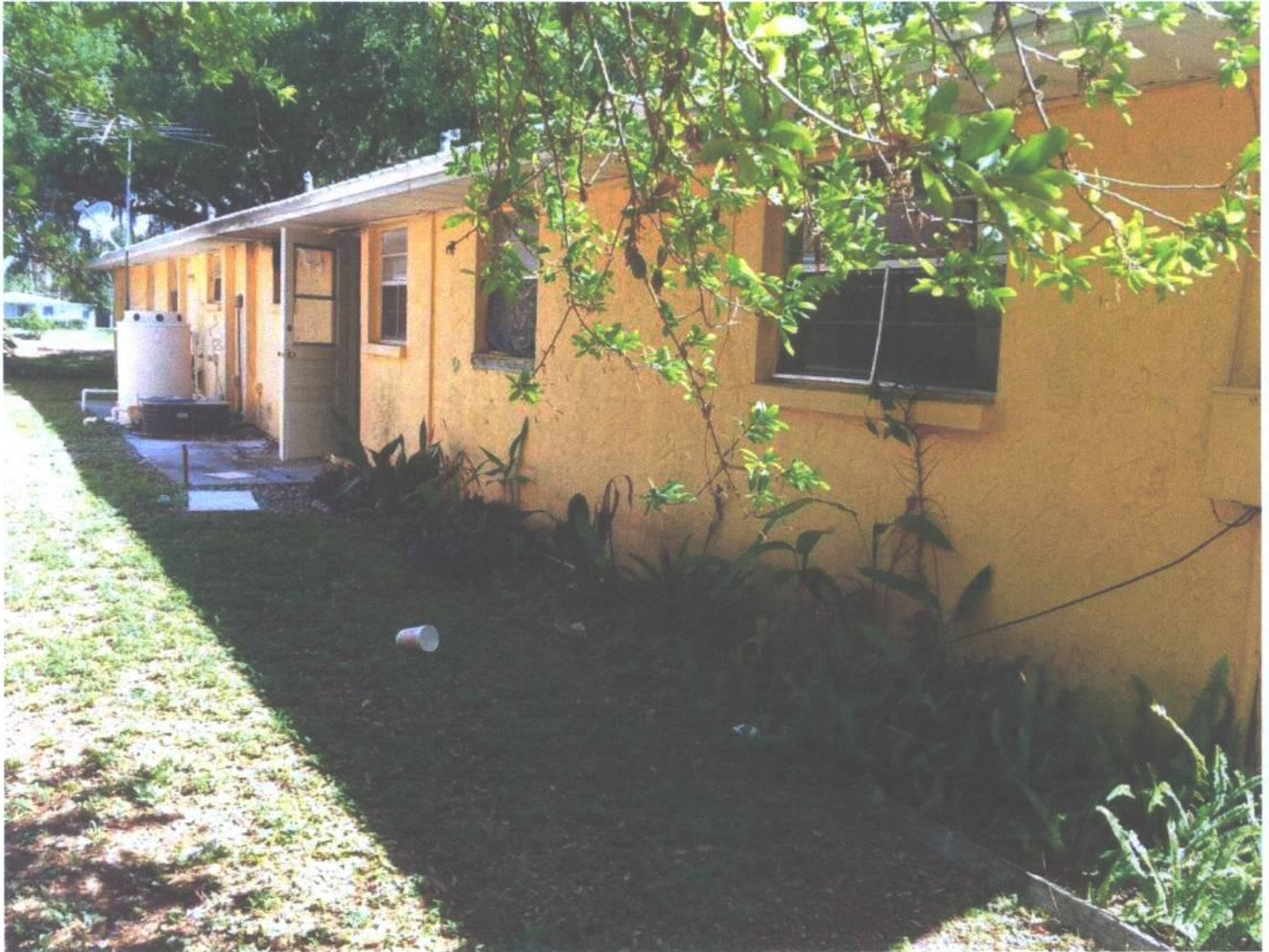
BACK OF HOUSE 04-05-14

If submitting more photographs than will fit on the preceding page, affix the additional photographs below. Identify all photographs with: date taken; "Front View" and "Rear View"; and, if required, "Right Side View" and "Left Side View." When applicable, photographs must show the foundation with representative examples of the flood openings or vents, as indicated in Section A8.