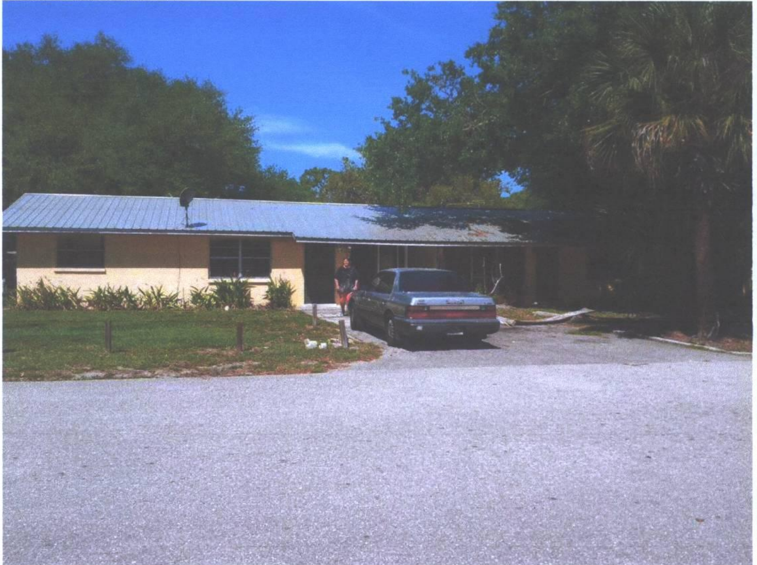
FRONT OF HOUSE 04-05-14

If using the Elevation Certificate to obtain NFIP flood insurance, affix at least 2 building photographs below according to the instructions for Item A6. Identify all photographs with date taken; "Front View" and "Rear View"; and, if required, "Right Side View" and "Left Side View." When applicable, photographs must show the foundation with representative examples of the flood openings or vents, as indicated in Section A8. If submitting more photographs than will fit on this page, use the Continuation Page.