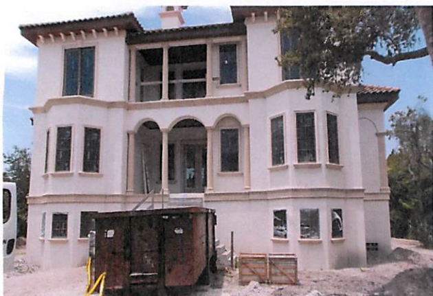
FRONT VIEW 6-24-14

If using the Elevation Certificate to obtain NFIP flood insurance, affix at least 2 building photographs below according to the instructions for Item A6. Identify all photographs with date taken; "Front View" and "Rear View"; and, if required, "Right Side View" and "Left Side View." When applicable, photographs must show the foundation with representative examples of the flood openings or vents, as indicated in Section A8. If submitting more photographs than will fit on this page, use the Continuation Page.