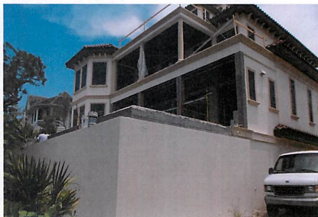
REAR VIEW 6-24-14