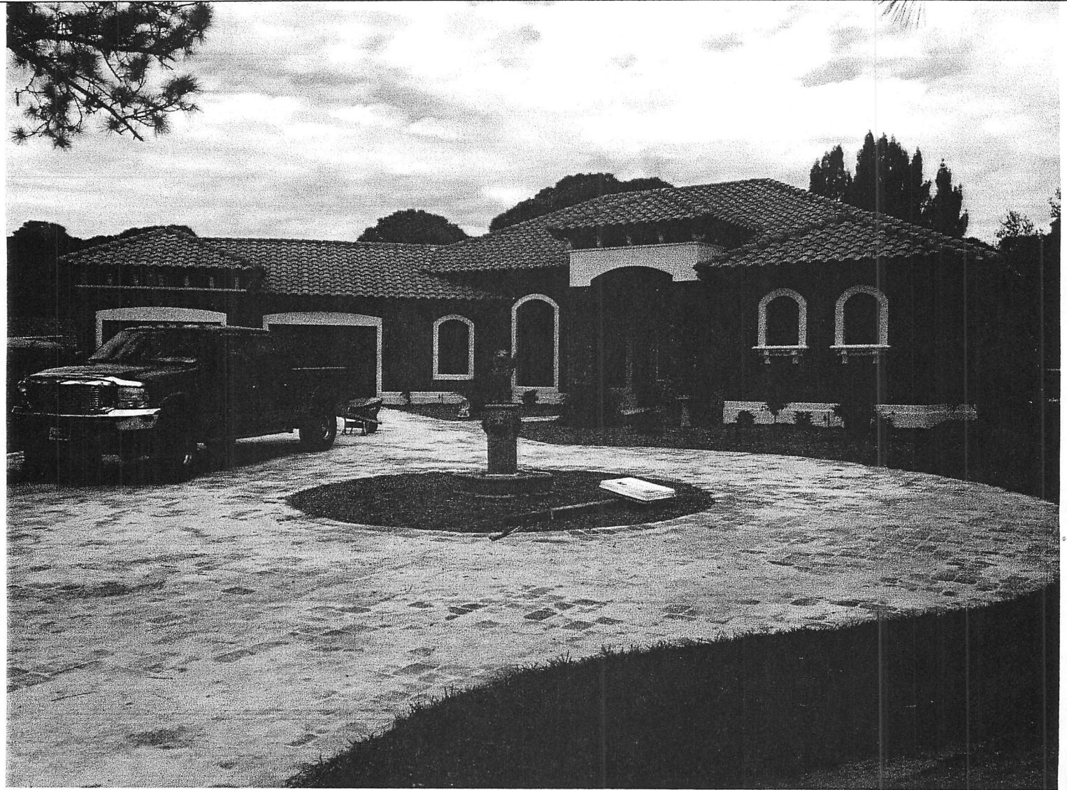
Front View 03-10-2014

If using the Elevation Certificate to obtain NFIP flood insurance, affix at least 2 building photographs below according to the instructions for Item A6. Identify all photographs with date taken; "Front View" and "Rear View"; and, if required, "Right Side View" and "Left Side View." When applicable, photographs must show the foundation with representative examples of the flood openings or vents, as indicated in Section A8. If submitting more photographs than will fit on this page, use the Continuation Page.