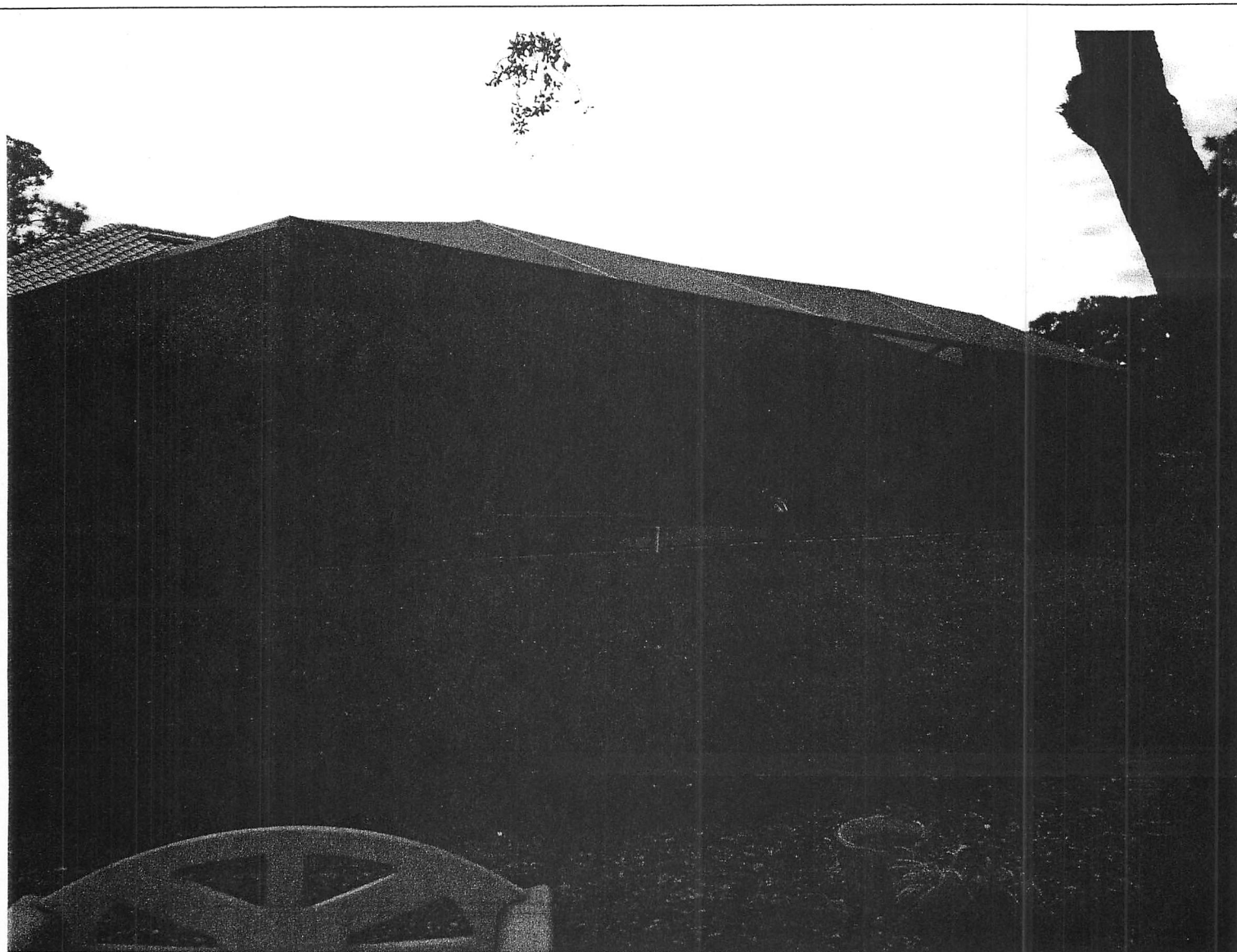
Rear View 03-11-2014

If submitting more photographs than will fit on the preceding page, affix the additional photographs below. Identify all photographs with: date taken; "Front View" and "Rear View"; and, if required, "Right Side View" and "Left Side View." When applicable, photographs must show the foundation with representative examples of the flood openings or vents, as indicated in Section A8.