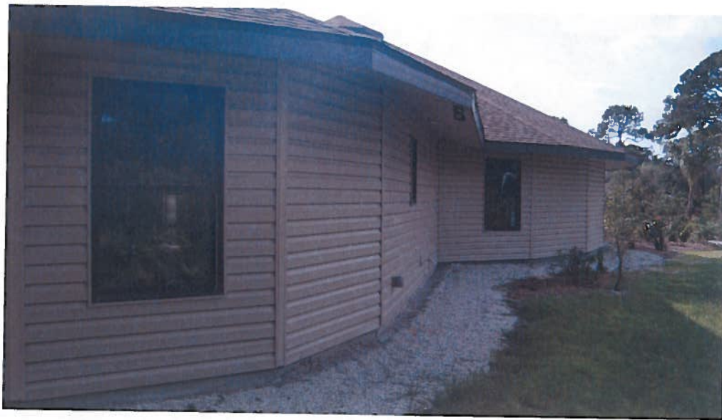
"LEFT SIDE VIEW" 6-30-2014