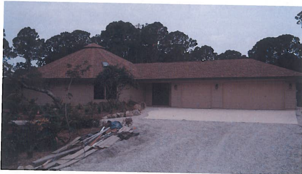
"FRONT VIEW" 6-30-2014

If using the Elevation Certificate to obtain NFIP flood insurance, affix at least 2 building photographs below according to the instructions for Item A6. Identify all photographs with date taken; "Front View" and "Rear View"; and, if required, "Right Side View" and "Left Side View." When applicable, photographs must show the foundation with representative examples of the flood openings or vents, as indicated in Section A8. If submitting more photographs than will fit on this page, use the Continuation Page.