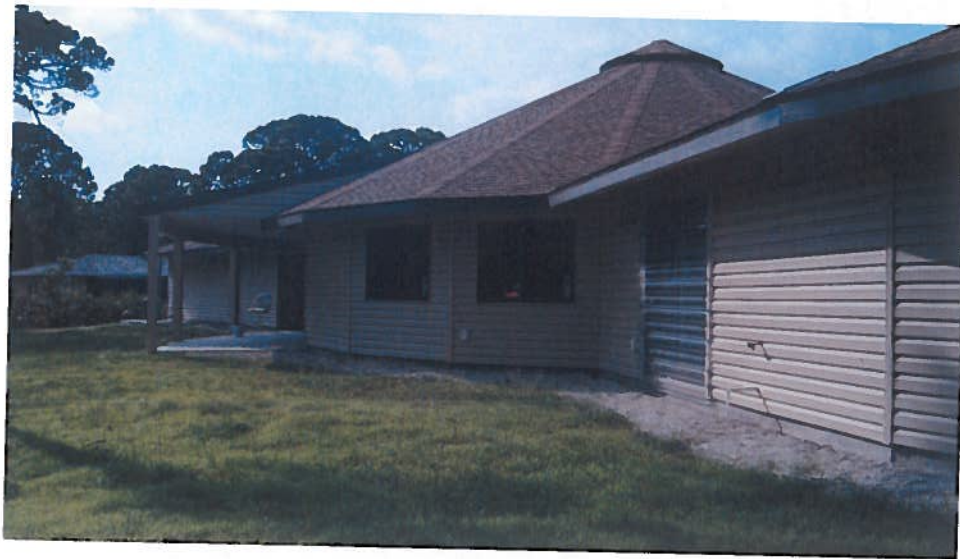
"REAR VIEW-EAST" 6-30-2014