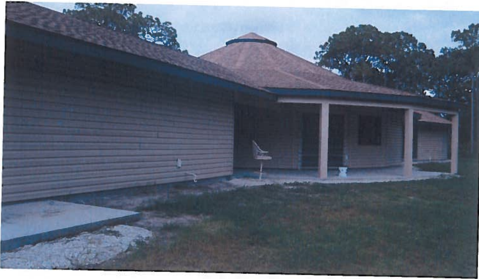
"REAR VIEW-WEST" 6-30-2014

If submitting more photographs than will fit on the preceding page, affix the additional photographs below. Identify all photographs with: date taken; "Front View" and "Rear View"; and, if required, "Right Side View" and "Left Side View." When applicable, photographs must show the foundation with representative examples of the flood openings or vents, as indicated in Section A8.