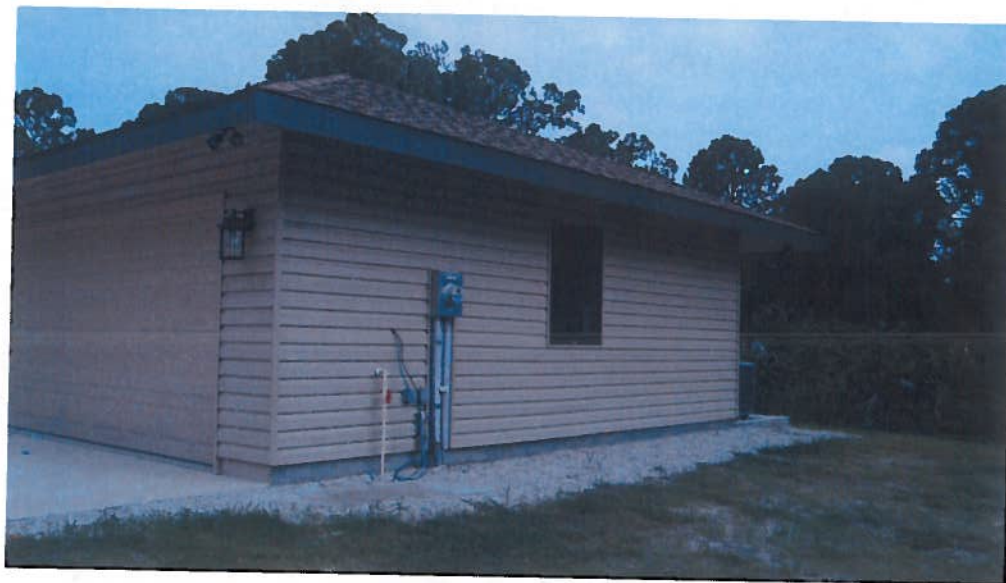
"RIGHT SIDE VIEW" 6-30-2014