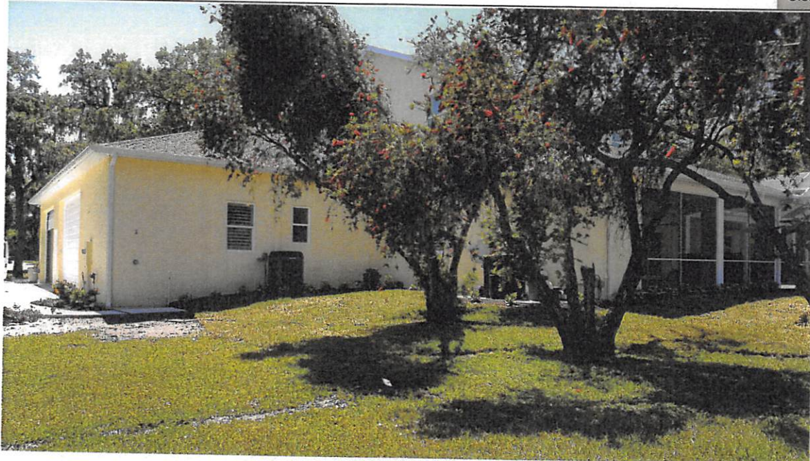
REAR VIEW 03/22/2018