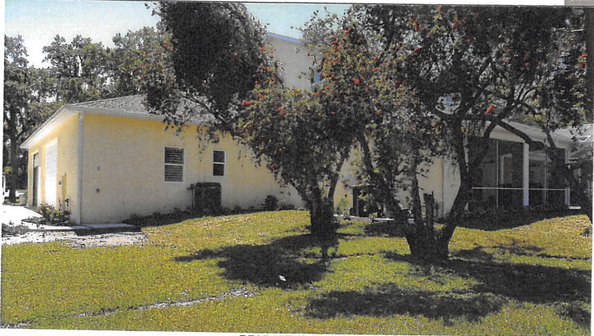
REAR VIEW 03/22/2018