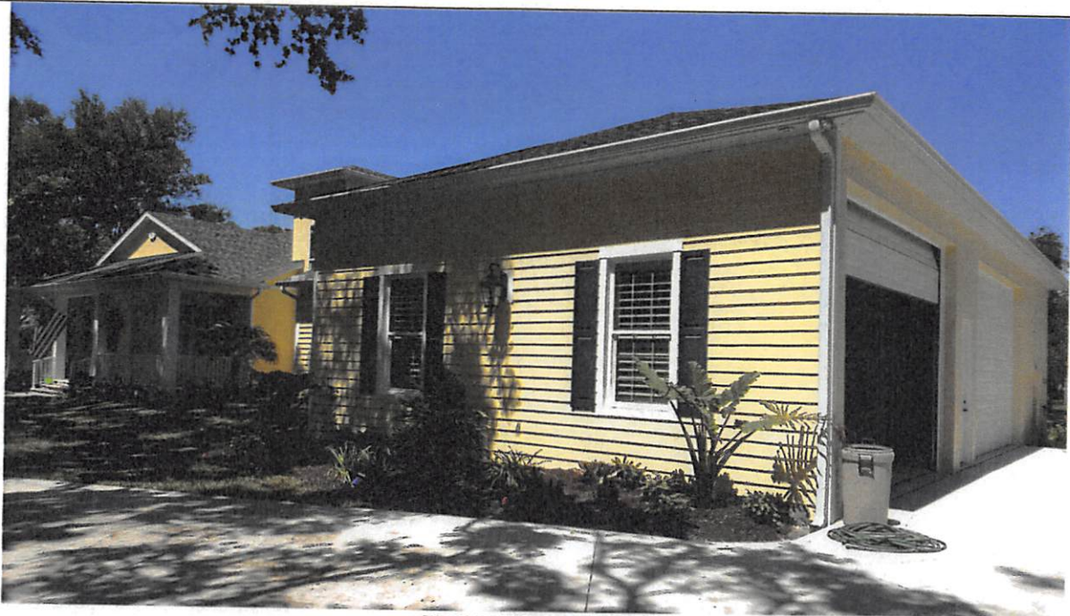
FRONT VIEW 03/22/2018

If submitting more photographs than will fit on the preceding page, affix the additional photographs below. Identify all photographs with: date taken; "Front View" and "Rear View"; and, if required, "Right Side View" and "Left Side View." When applicable, photographs must show the foundation with representative examples of the flood openings or vents, as indicated in Section A8.