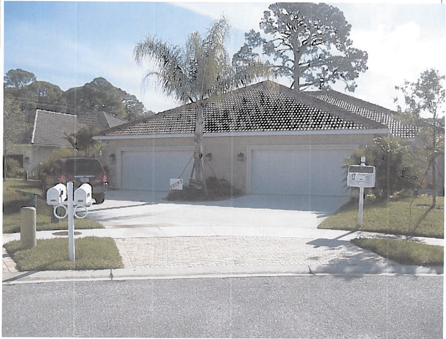
Front View of Building (April 1, 2015)

If using the Elevation Certificate to obtain NFIP flood insurance, affix at least 2 building photographs below according to the instructions for Item A6. Identify all photographs with date taken; "Front View" and "Rear View"; and, if required, "Right Side View" and "Left Side View." When applicable, photographs must show the foundation with representative examples of the flood openings or vents, as indicated in Section A8. If submitting more photographs than will fit on this page, use the Continuation Page.