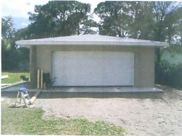
FRONT VIEW 3-3-11