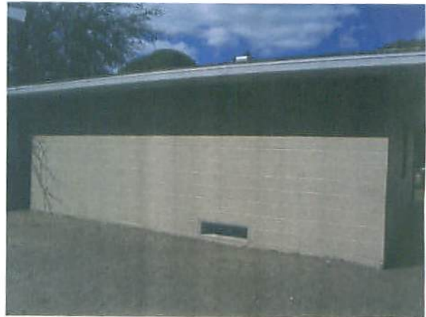
REAR VIEW 3-3-11