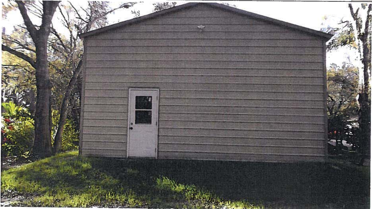
REAR VIEW 01-10-2019