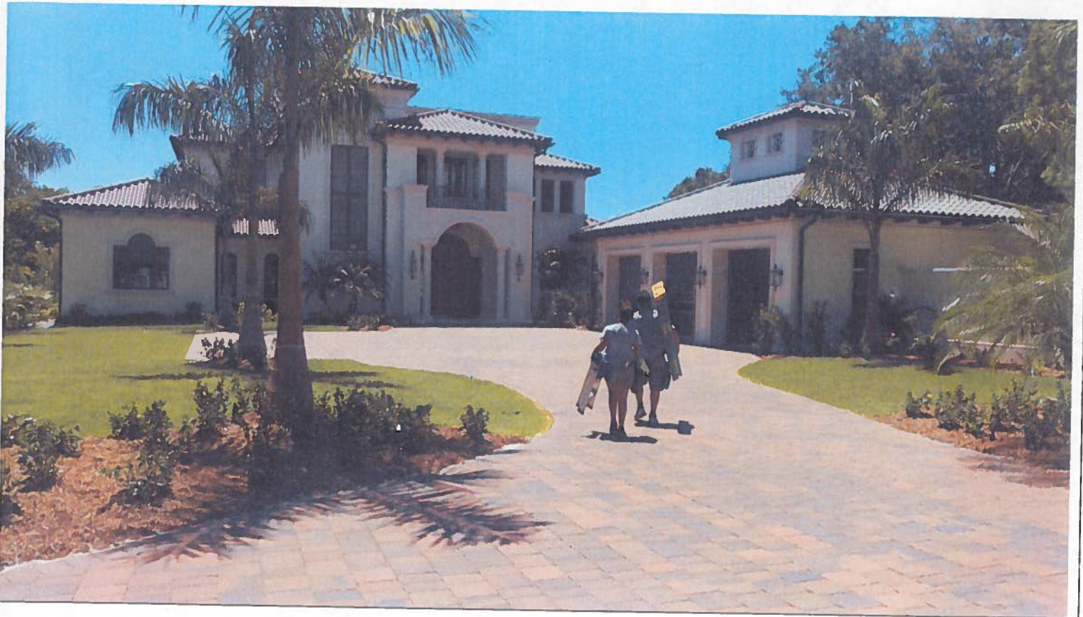
East Side "Front" View of House and Southeast Side View of Garage 1:

If using the Elevation Certificate to obtain NFIP flood insurance, affix at least 2 building photographs below according to the instructions for Item A6. Identify all photographs with date taken; "Front View" and "Rear View"; and, if required, "Right Side View" and "Left Side View." When applicable, photographs must show the foundation with representative examples of the flood openings or vents, as indicated in Section A8. If submitting more photographs than will fit on this page, use the Continuation Page.