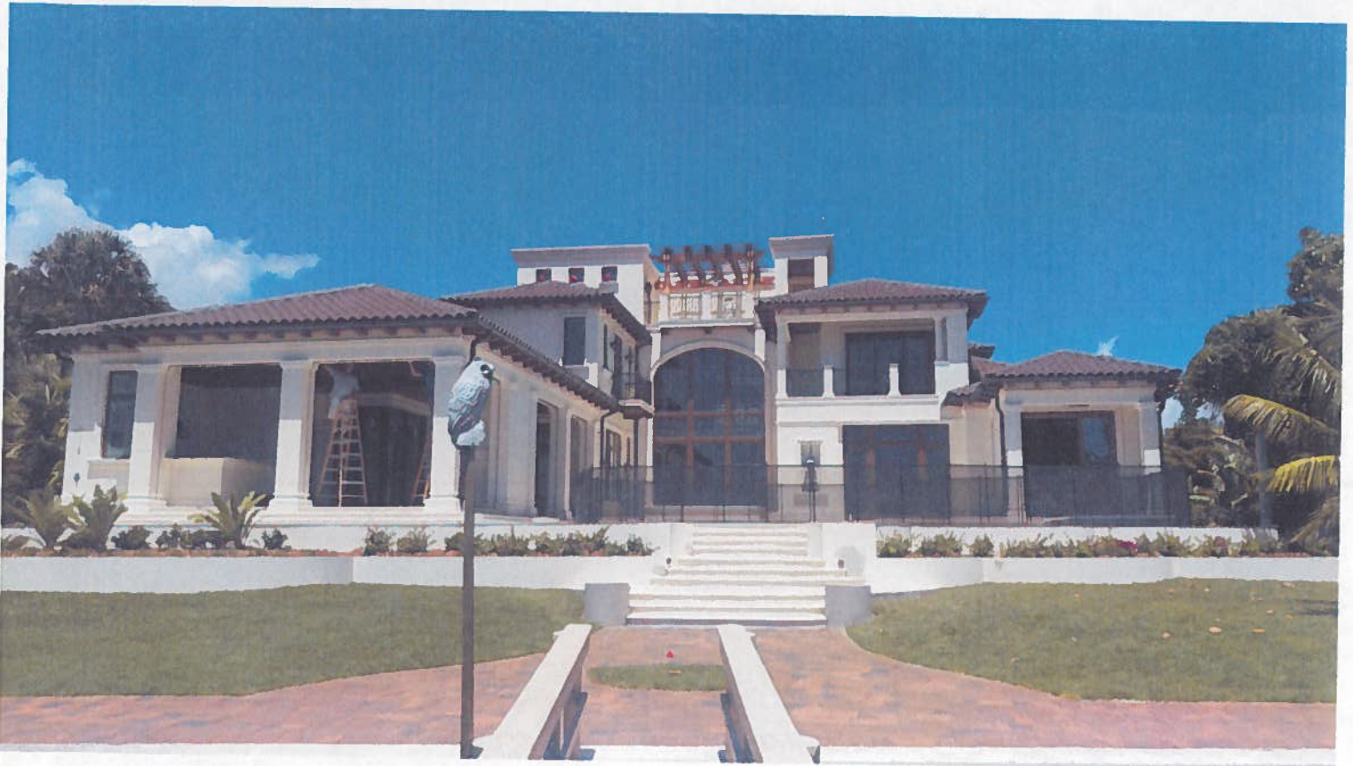
West Side "Rear" View of House:

If submitting more photographs than will fit on the preceding page, affix the additional photographs below. Identify all photographs with: date taken; "Front View" and "Rear View"; and, if required, "Right Side View" and "Left Side View." When applicable, photographs must show the foundation with representative examples of the flood openings or vents, as indicated in Section A8.