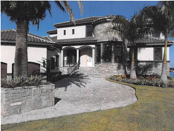
FRONT VIEW 10/7/15

If using the Elevation Certificate to obtain NFIP flood insurance, affix at least 2 building photographs below according to the instructions for Item A6. Identify all photographs with date taken; "Front View" and "Rear View"; and, if required, "Right Side View" and "Left Side View." When applicable, photographs must show the foundation with representative examples of the flood openings or vents, as indicated in Section A8. If submitting more photographs than will fit on this page, use the Continuation Page.