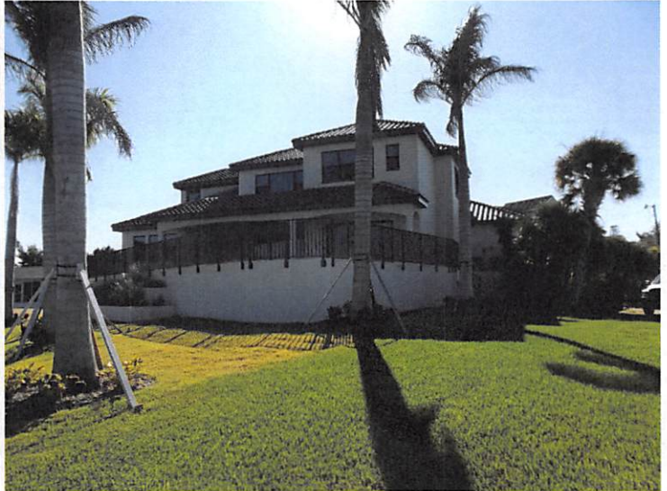
REAR VIEW 10/7/15