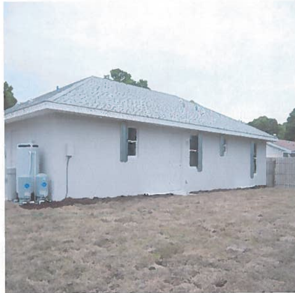
REAR VIEW 3-17-2009