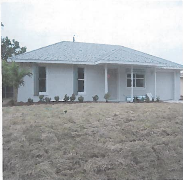
FRONT VIEW 3-17-2009

If using the Elevation Certificate to obtain NFIP flood insurance, affix at least two building photographs below according to the instructions for Item A6. Identify all photographs with: date taken; "Front View" and "Rear View"; and, if required, "Right Side View" and "Left Side View." If submitting more photographs than will fit on this page, use the Continuation Page, following.