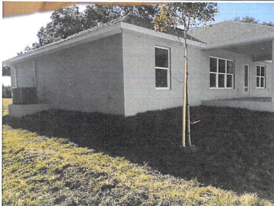
REAR VIEW 12/23/2020