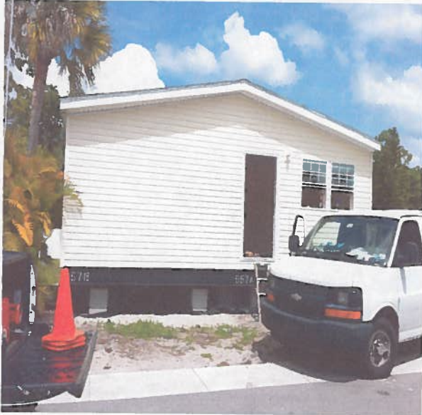
FRONT VIEW 5-30-2013

If using the Elevation Certificate to obtain NFIP flood insurance, affix at least 2 building photographs below according to the instructions for Item A6. Identify all photographs with date taken; "Front View" and "Rear View"; and, if required, "Right Side View" and "Left Side View." When applicable, photographs must show the foundation with representative examples of the flood openings or vents, as indicated in Section A8. If submitting more photographs than will fit on this page, use the Continuation Page.