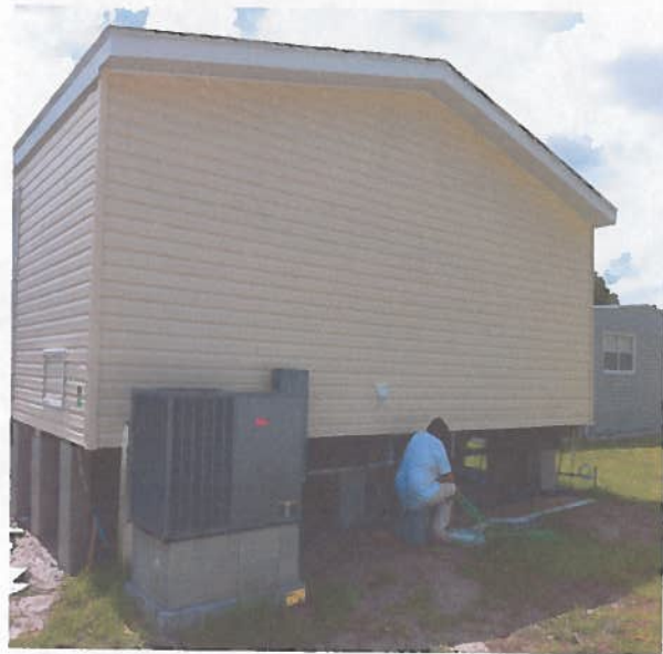
REAR VIEW 5-30-2013