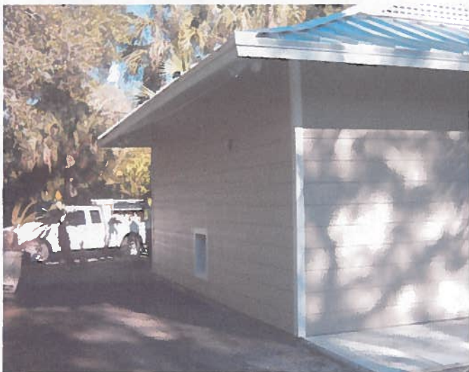
REAR VIEW 1/23/09