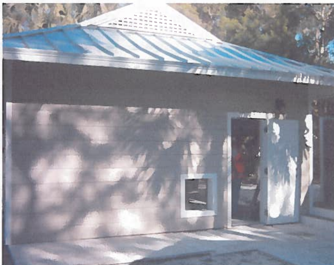
LEFT VIEW 1/23/09