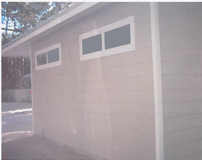
RIGHT VIEW 1/23/09