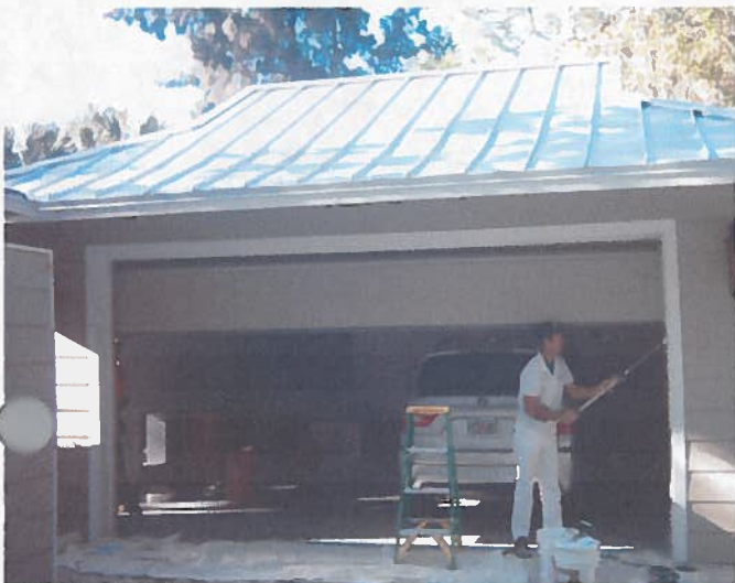
FRONT VIEW 1/23/09

If using the Elevation Certificate to obtain NFIP flood insurance, affix at least two building photographs below according to the instructions for Item A6. Identify all photographs with: date taken; "Front View" and "Rear View"; and, if required, "Right Side View" and "Left Side View." If submitting more photographs than will fit on this page, use the Continuation Page, following.