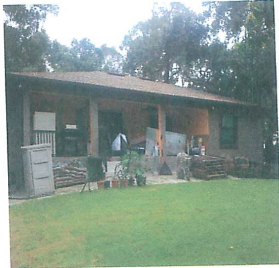
BACK VIEW 7-26-2011