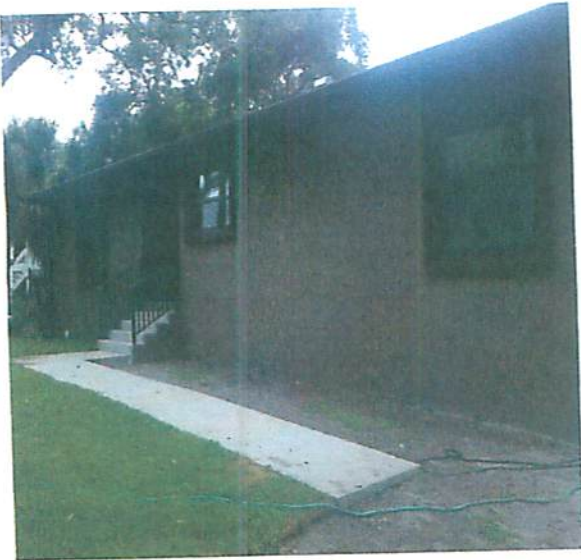
FRONT VIEW 7-26-2011