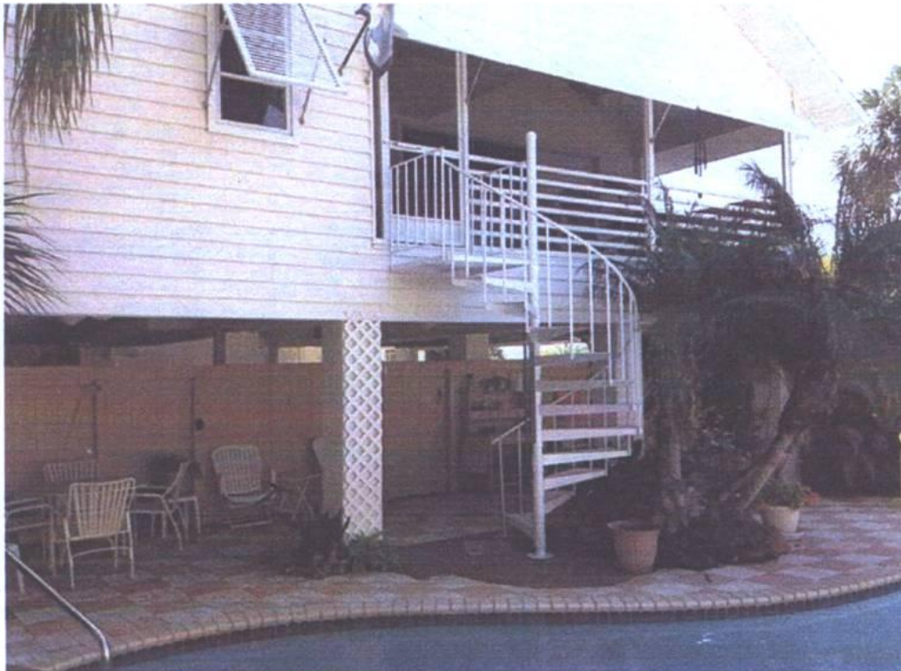
BACK OF HOUSE 04-10-13