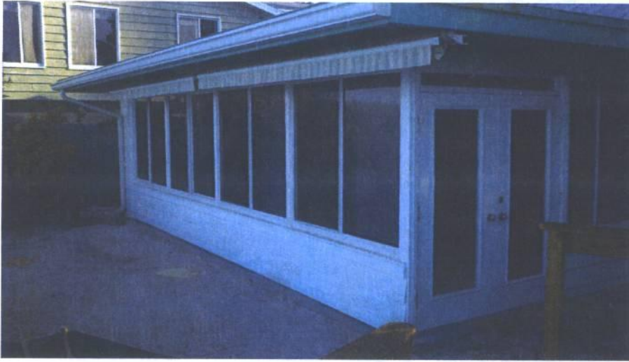
REAR VIEW – LEFT SIDE