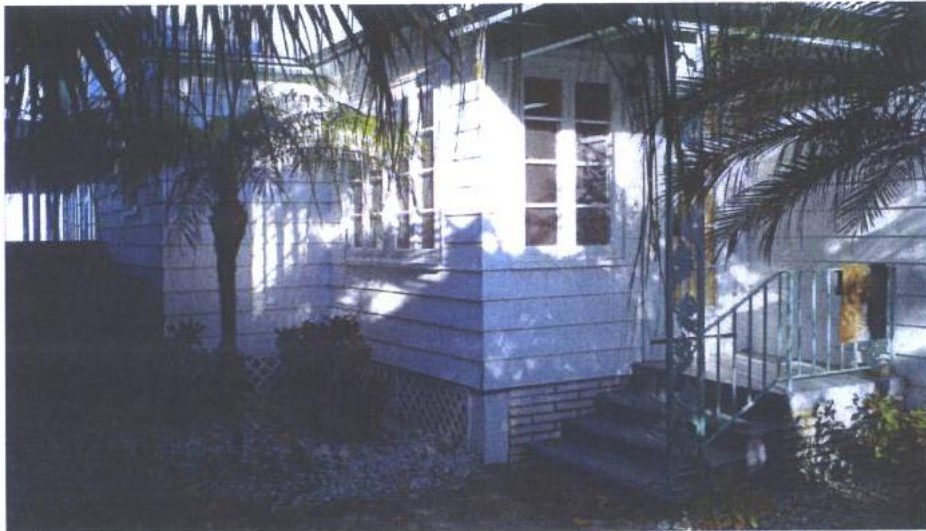
FRONT VIEW – LEFT SIDE

If submitting more photographs than will fit on the preceding page, affix the additional photographs below. Identify all photographs with: date taken; "Front View" and "Rear View"; and, if required, "Right Side View" and "Left Side View."