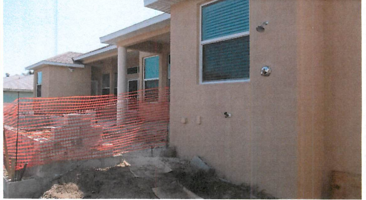
REAR VIEW 4/15/14