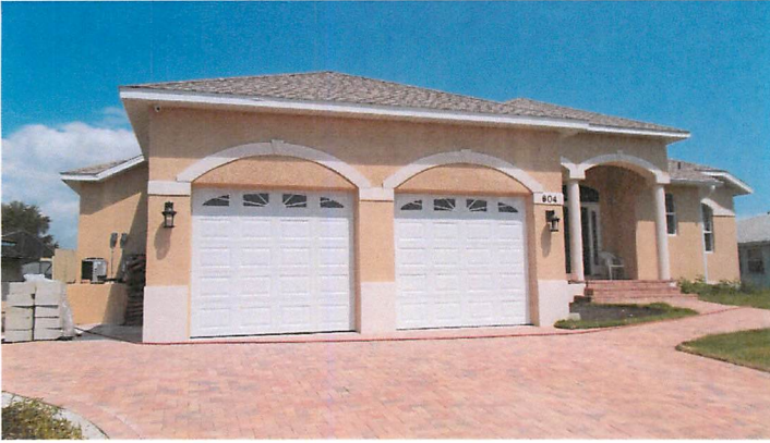
FRONT VIEW 4/15/14

If using the Elevation Certificate to obtain NFIP flood insurance, affix at least 2 building photographs below according to the instructions for Item A6. Identify all photographs with date taken; "Front View" and "Rear View"; and, if required, "Right Side View" and "Left Side View." When applicable, photographs must show the foundation with representative examples of the flood openings or vents, as indicated in Section A8. If submitting more photographs than will fit on this page, use the Continuation Page.