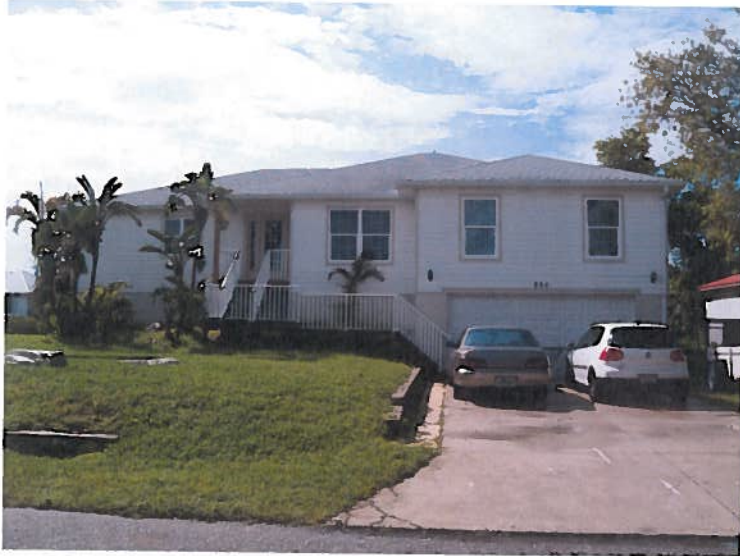
FRONT VIEW 7-25-13

If using the Elevation Certificate to obtain NFIP flood insurance, affix at least 2 building photographs below according to the instructions for Item A6. Identify all photographs with date taken; "Front View" and "Rear View"; and, if required, "Right Side View" and "Left Side View." When applicable, photographs must show the foundation with representative examples of the flood openings or vents, as indicated in Section A8. If submitting more photographs than will fit on this page, use the Continuation Page.