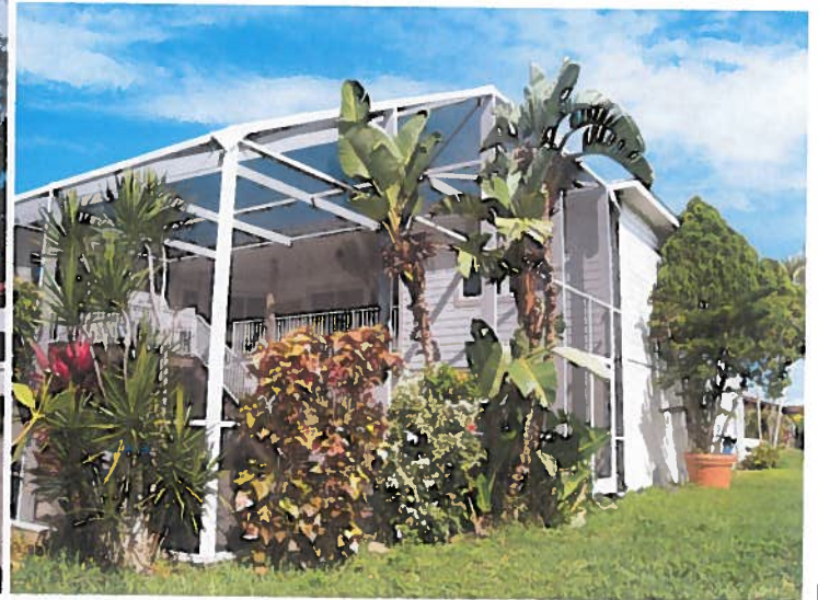
REAR VIEW 7-25-13