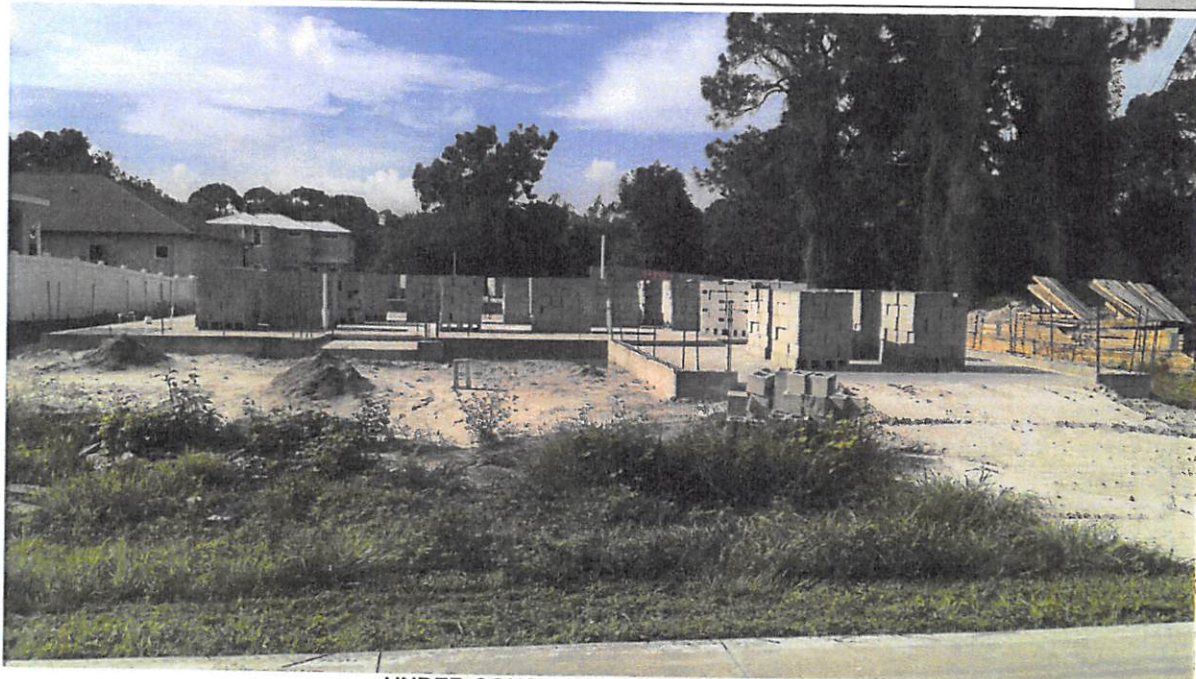
UNDER CONSTRUCTION 08-21-2020