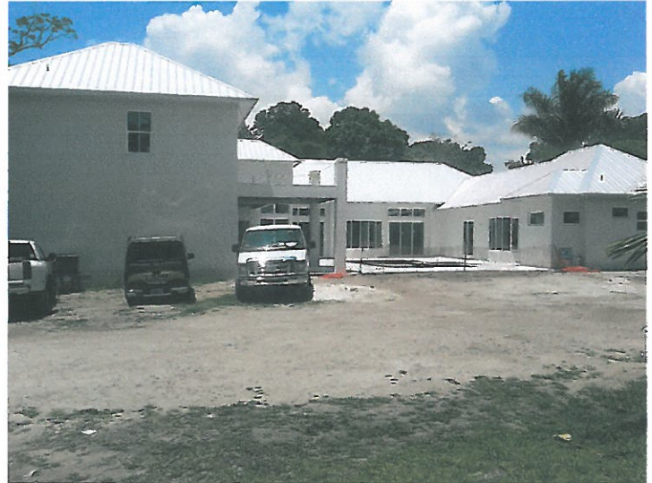
SIDE VIEW 5-22-15