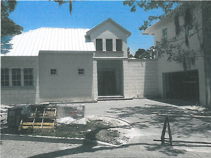
FRONT VIEW 5-22-14