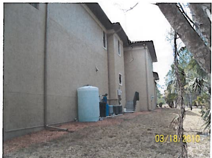
LEFT VIEW 3-18-10