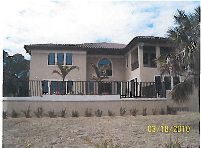
REAR VIEW 3-18-10