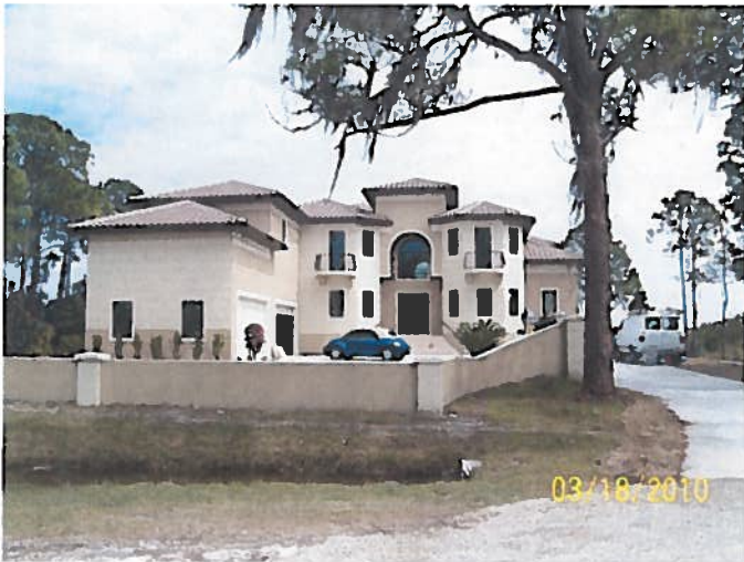
FRONT VIEW 3-18-10

If using the Elevation Certificate to obtain NFIP flood insurance, affix at least two building photographs below according to the instructions for Item A6. Identify all photographs with: date taken; "Front View" and "Rear View"; and, if required, "Right Side View" and "Left Side View." If submitting more photographs than will fit on this page, use the Continuation Page on the reverse.