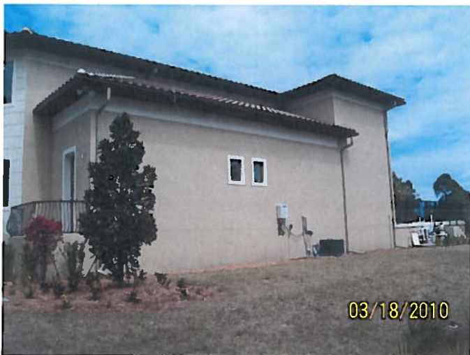
RIGHT VIEW 3-18-10