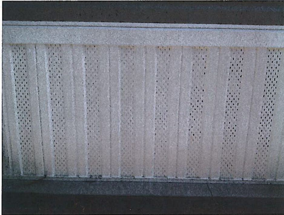
Photo One Caption Perforated Vinyl Skirting underneath Mobile Home Date Taken 02/16/17

If submitting more photographs than will fit on the preceding page, affix the additional photographs below. Identify all photographs with: date taken; "Front View" and "Rear View"; and, if required, "Right Side View" and "Left Side View." When applicable, photographs must show the foundation with representative examples of the flood openings or vents, as indicated in Section A8.