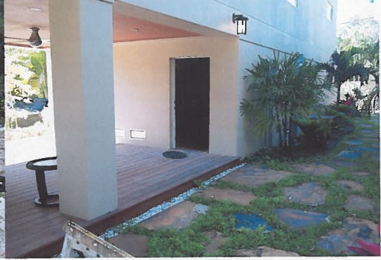
REAR VIEW 1/30/15