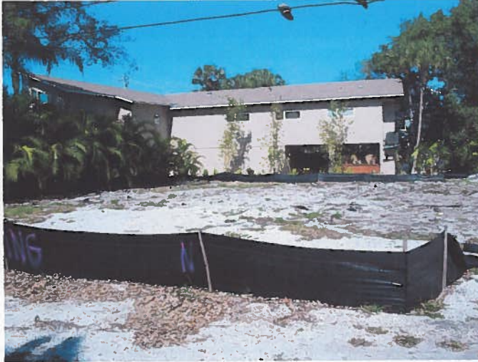
FRONT VIEW 1/30/15