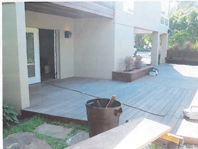
LEFT SIDE VIEW 1/30/15