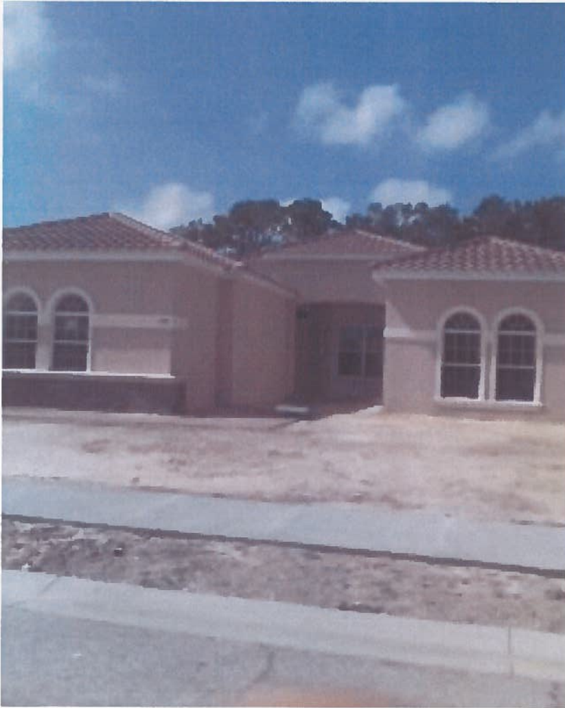
FRONT PICTURE (7/21/10)