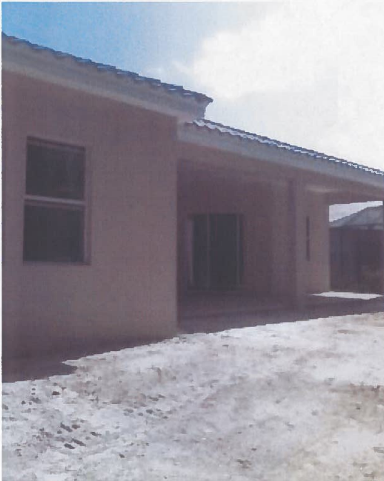
REAR PICTURE (7/21/10)

If submitting more photographs than will fit on the preceding page, affix the additional photographs below. Identify all photographs with: date taken; "Front View" and "Rear View"; and, if required, "Right Side View" and "Left Side View."