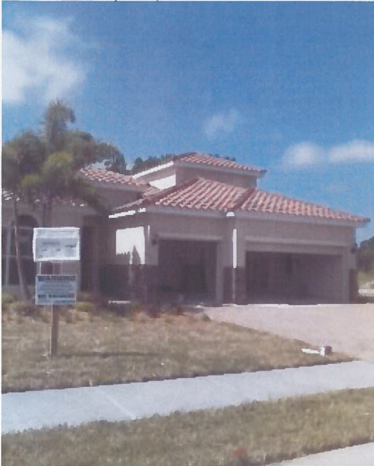
FRONT PICTURE (7/21/10)

If using the Elevation Certificate to obtain NFIP flood insurance, affix at least two building photographs below according to the instructions for Item A6. Identify all photographs with: date taken; "Front View" and "Rear View"; and, if required, "Right Side View" and "Left Side View." If submitting more photographs than will fit on this page, use the Continuation Page on the reverse.