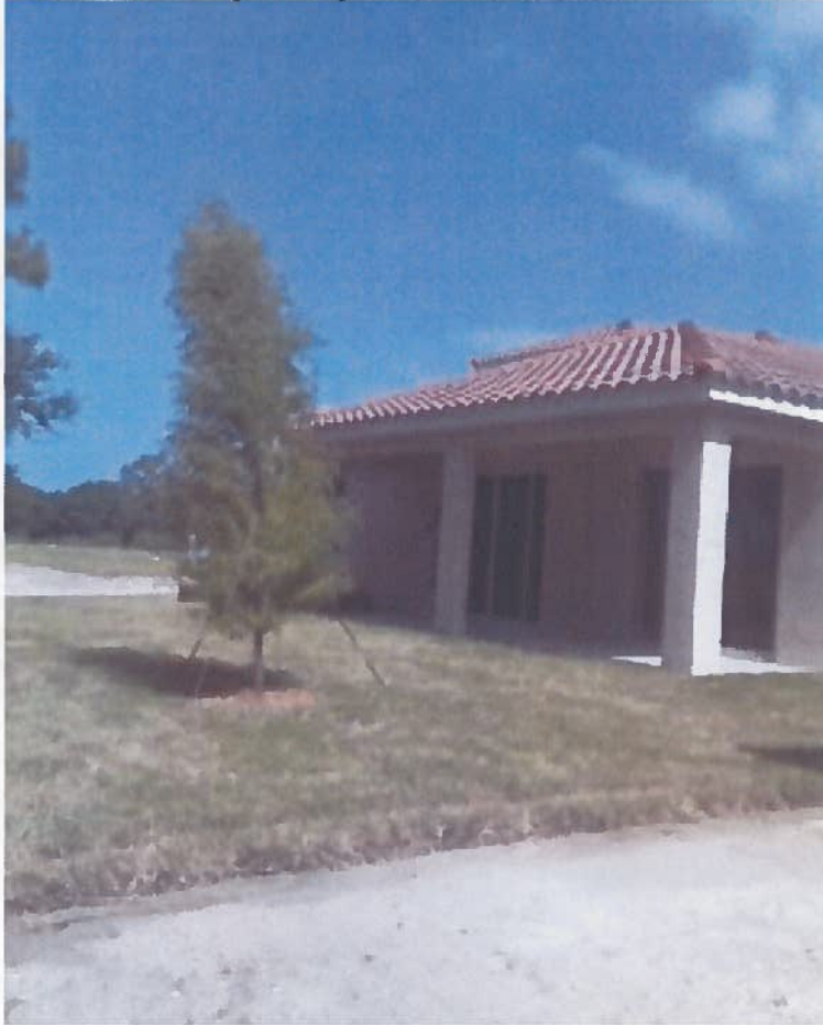
REAR PICTURE (7/21/10)

If submitting more photographs than will fit on the preceding page, affix the additional photographs below. Identify all photographs with: date taken; "Front View" and "Rear View"; and, if required, "Right Side View" and "Left Side View."