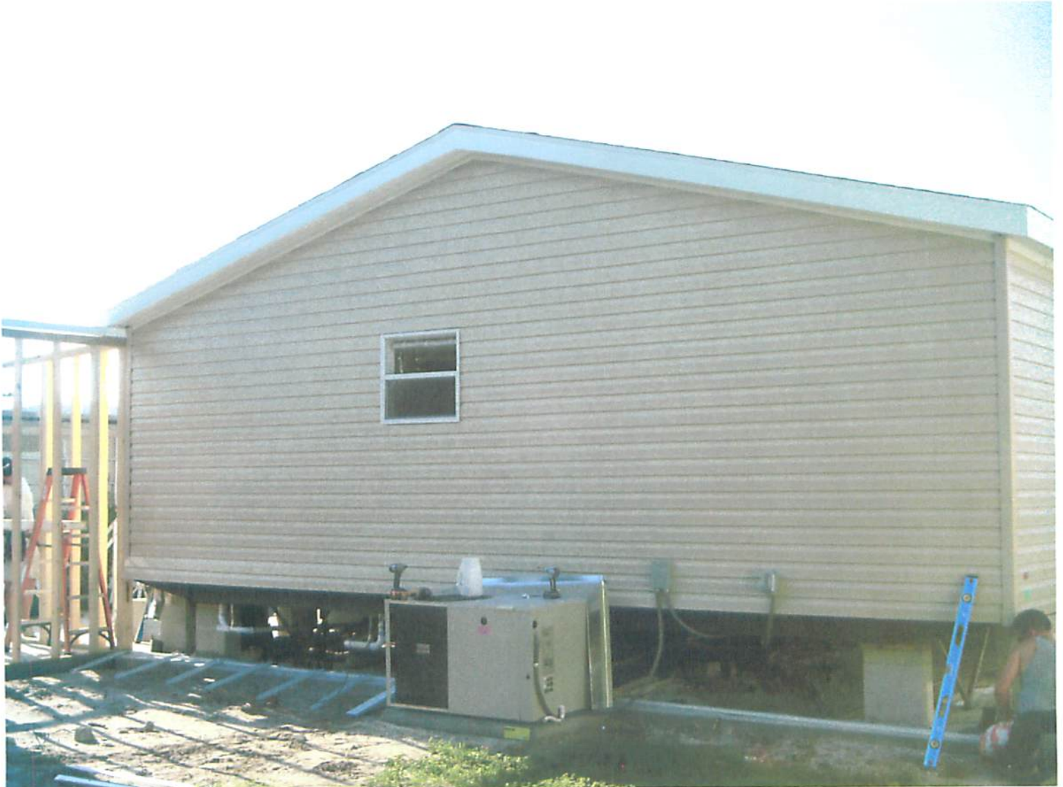
Rear View 10-14-2011

If submitting more photographs than will fit on the preceding page, affix the additional photographs below. Identify all photographs with: date taken; "Front View" and "Rear View"; and, if required, "Right Side View" and "Left Side View."