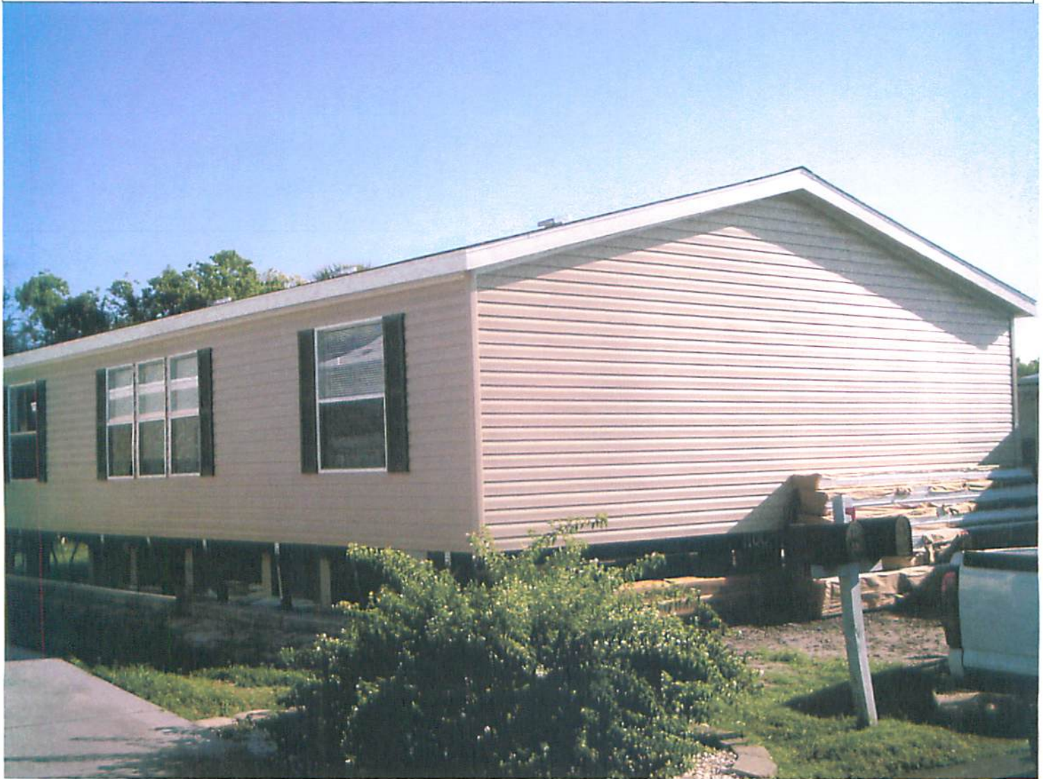
Front View 10-14-11

If using the Elevation Certificate to obtain NFIP flood insurance, affix at least two building photographs below according to the instructions for Item A6. Identify all photographs with: date taken; "Front View" and "Rear View"; and, if required, "Right Side View" and "Left Side View." If submitting more photographs than will fit on this page, use the Continuation Page on the reverse.