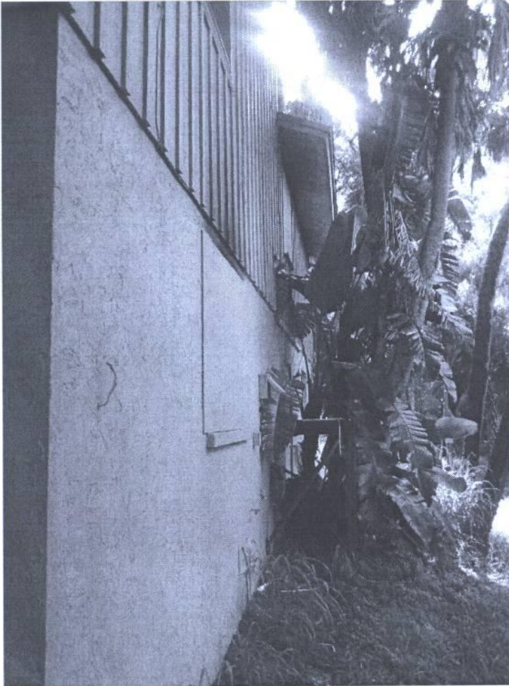
FLOOD VENT 8-19-2013