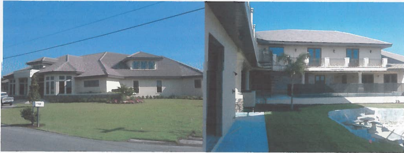
FRONT VIEW 4-23-2010

If using the Elevation Certificate to obtain NFIP flood insurance, affix at least two building photographs below according to the instructions for Item A6. Identify all photographs with: date taken; "Front View" and "Rear View"; and, if required, "Right Side View" and "Left Side View." If submitting more photographs than will fit on this page, use the Continuation Page, following.