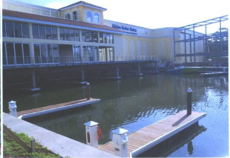
REAR VIEW 2/5/14