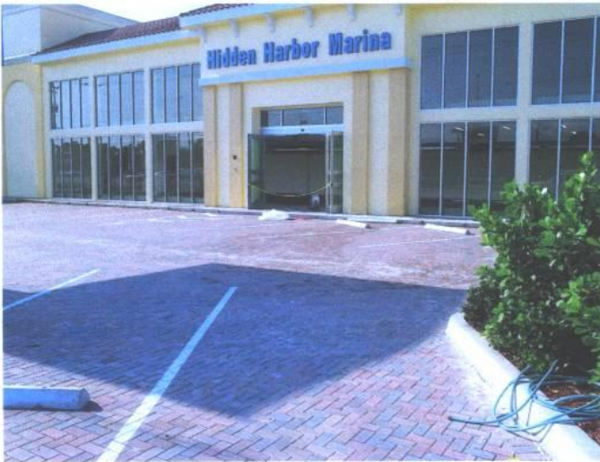
FRONT VIEW 2/5/14