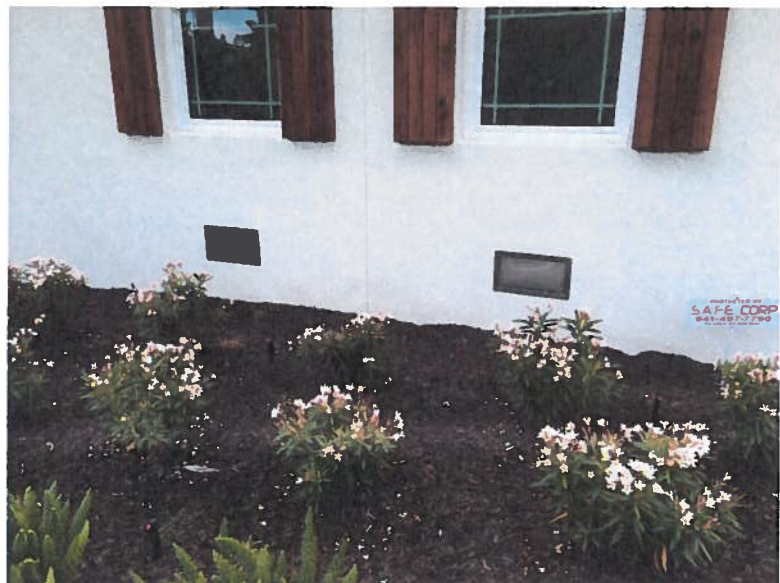
SMART VENT VIEW 5/06/2014