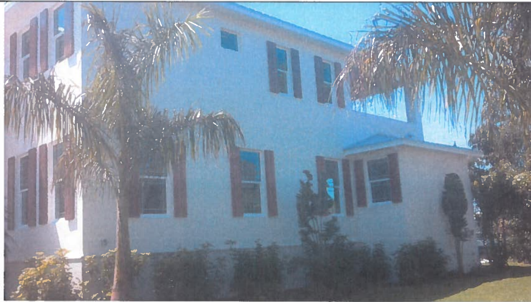
SIDE VIEW (WEST SIDE) 5/06/2014

If submitting more photographs than will fit on the preceding page, affix the additional photographs below. Identify all photographs with: date taken; "Front View" and "Rear View"; and, if required, "Right Side View" and "Left Side View." When applicable, photographs must show the foundation with representative examples of the flood openings or vents, as indicated in Section A8.