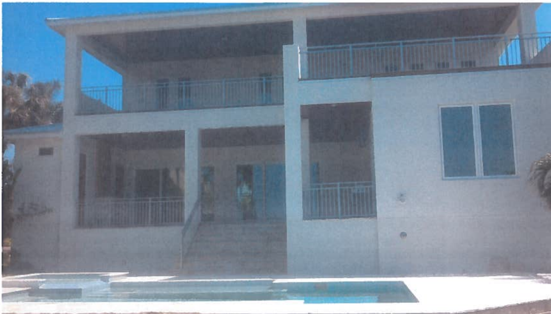
REAR VIEW (SOUTH SIDE) 5/06/2014