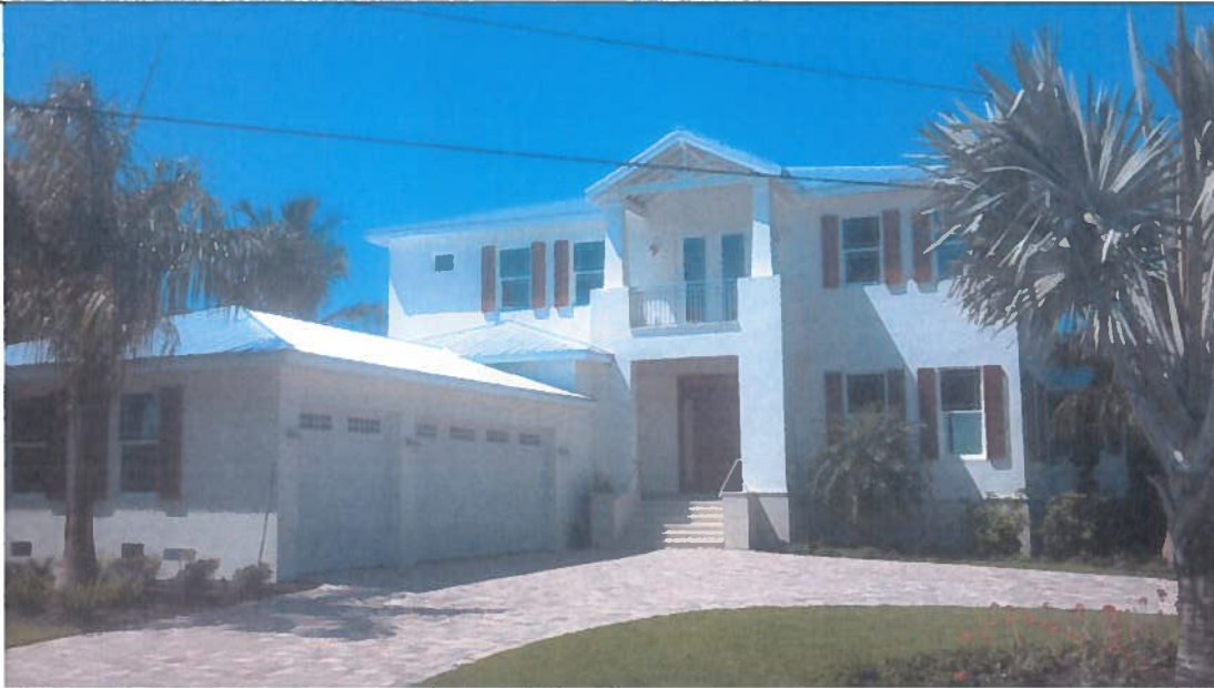
FRONT VIEW (NORTH SIDE) 5/06/2014

If using the Elevation Certificate to obtain NFIP flood insurance, affix at least 2 building photographs below according to the instructions for Item A6. Identify all photographs with date taken; "Front View" and "Rear View"; and, if required, "Right Side View" and "Left Side View." When applicable, photographs must show the foundation with representative examples of the flood openings or vents, as indicated in Section A8. If submitting more photographs than will fit on this page, use the Continuation Page.