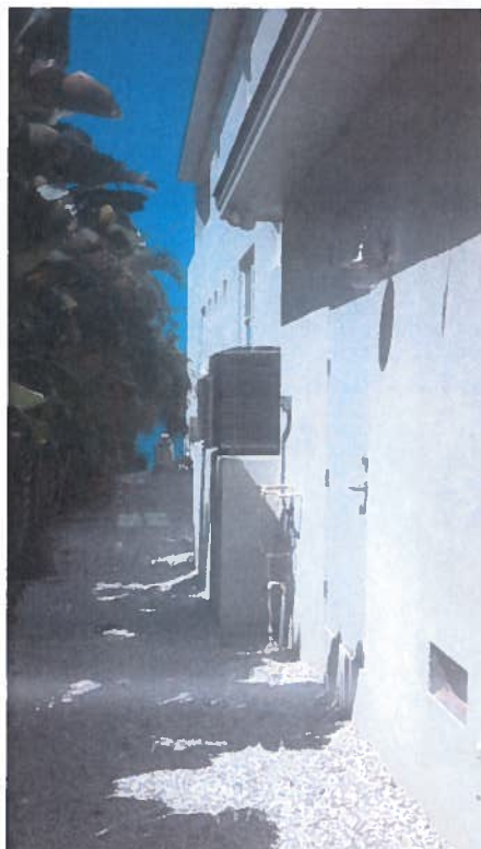
SIDE VIEW (EAST SIDE) 5/06/2014