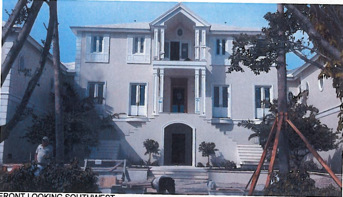
FRONT LOOKING SOUTHWEST