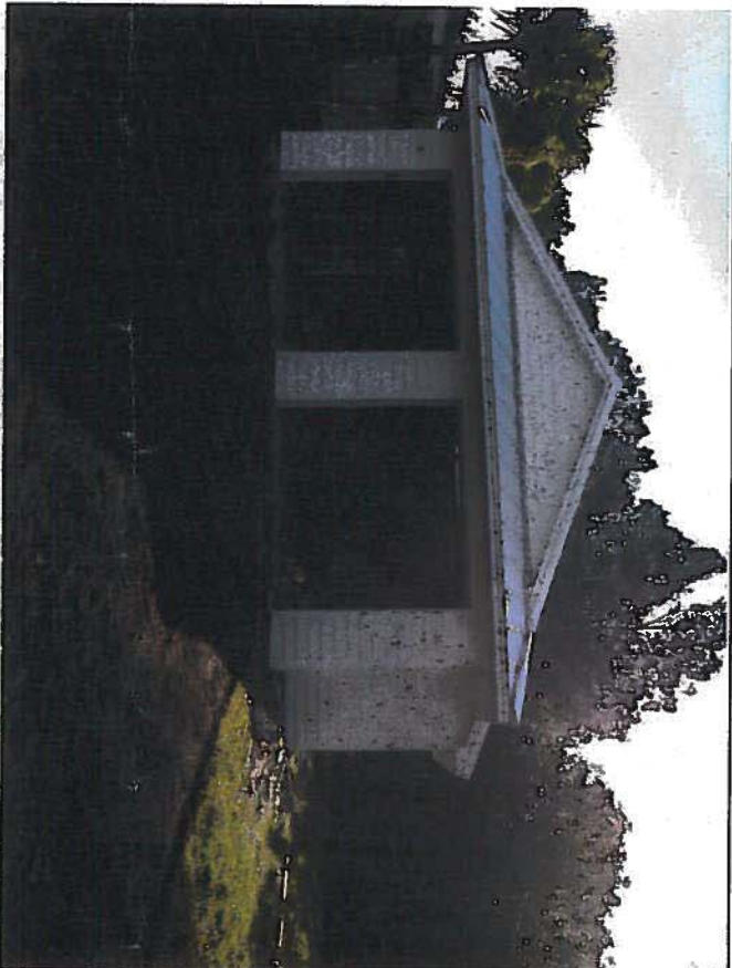
FRONT VIEW 01/17/18

If using the Elevation Certificate to obtain NFIP flood insurance, affix at least 2 building photographs below according to the instructions for Item A6. Identify all photographs with date taken; "Front View" and "Rear View"; and, if required, "Right Side View" and "Left Side View." When applicable, photographs must show the foundation with representative examples of the flood openings or vents, as indicated in Section A8. If submitting more photographs than will fit on this page, use the Continuation Page.