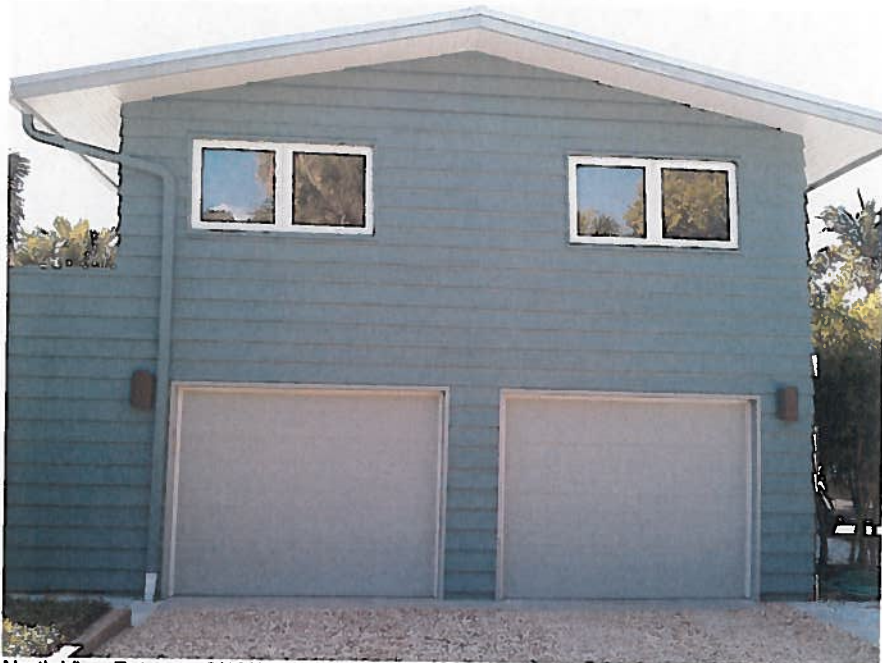
North View Entrance 2/13/15

If using the Elevation Certificate to obtain NFIP flood insurance, affix at least 2 building photographs below according to the instructions for Item A6. Identify all photographs with date taken; "Front View" and "Rear View"; and, if required, "Right Side View" and "Left Side View." When applicable, photographs must show the foundation with representative examples of the flood openings or vents, as indicated in Section A8. If submitting more photographs than will fit on this page, use the Continuation Page.