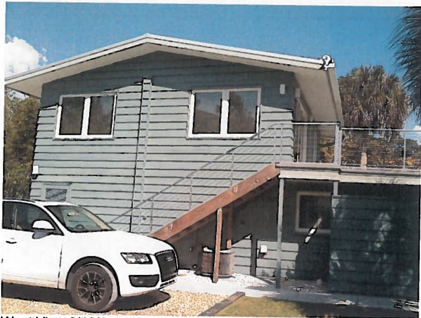
West View 2/13/15