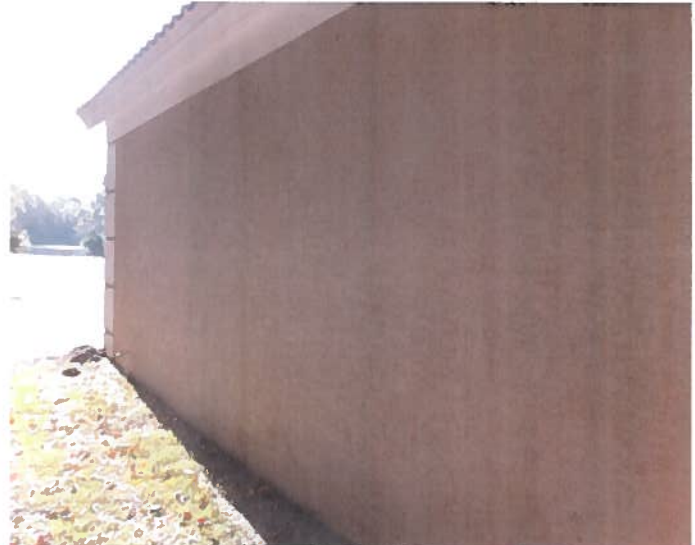
REAR VIEW 4-6-15