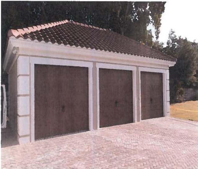
FRONT VIEW 4-6-15

If using the Elevation Certificate to obtain NFIP flood insurance, affix at least 2 building photographs below according to the instructions for Item A6. Identify all photographs with date taken; "Front View" and "Rear View"; and, if required, "Right Side View" and "Left Side View." When applicable, photographs must show the foundation with representative examples of the flood openings or vents, as indicated in Section A8. If submitting more photographs than will fit on this page, use the Continuation Page.