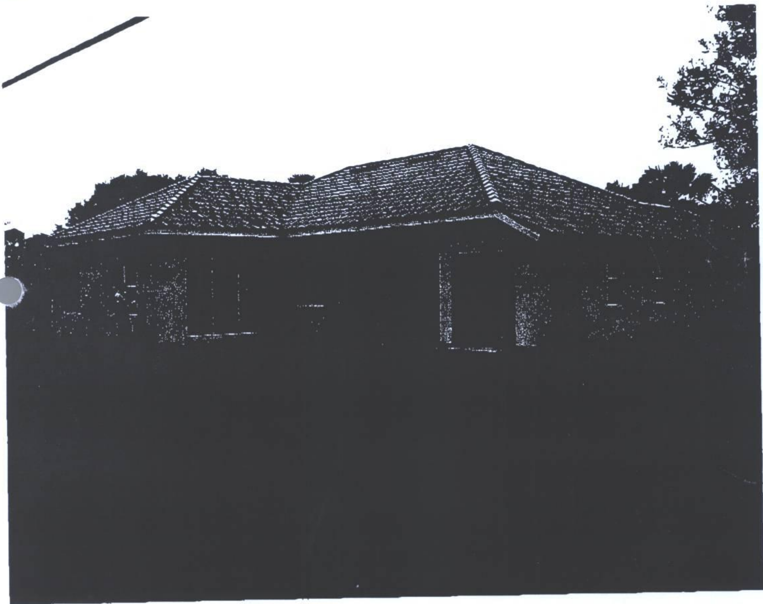
REAR LEFT VIEW (4/10/07)