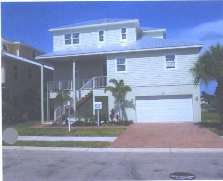
FRONT VIEW 8/29/8