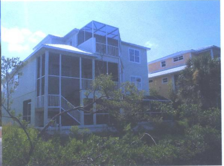
REAR VIEW 8/29/8