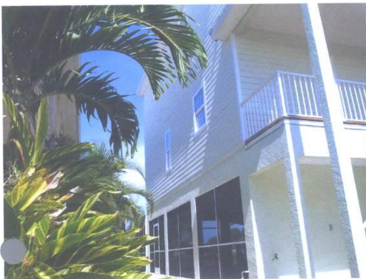
LEFT SIDE VIEW 8/29/8