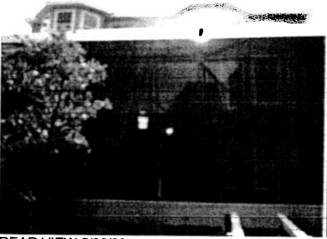
REAR VIEW 5/26/09