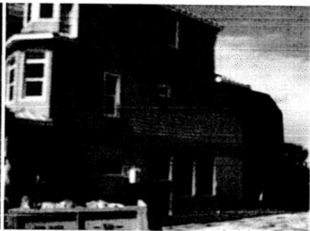
RIGHT VIEW 5/26/09