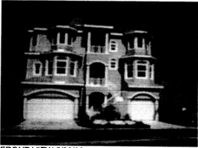
FRONT VIEW 5/26/09