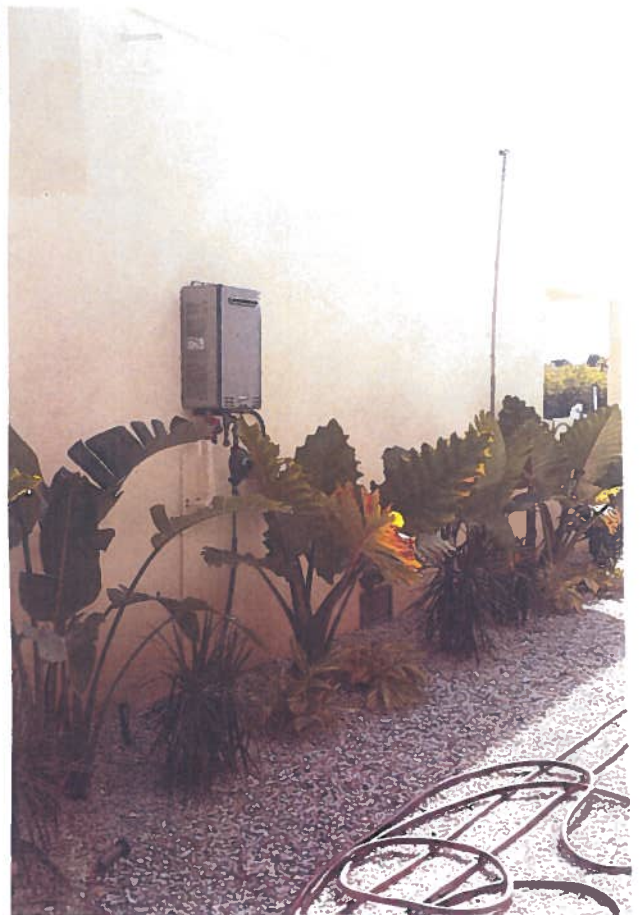
S O U T H S I D E V I E W July 21, 2015