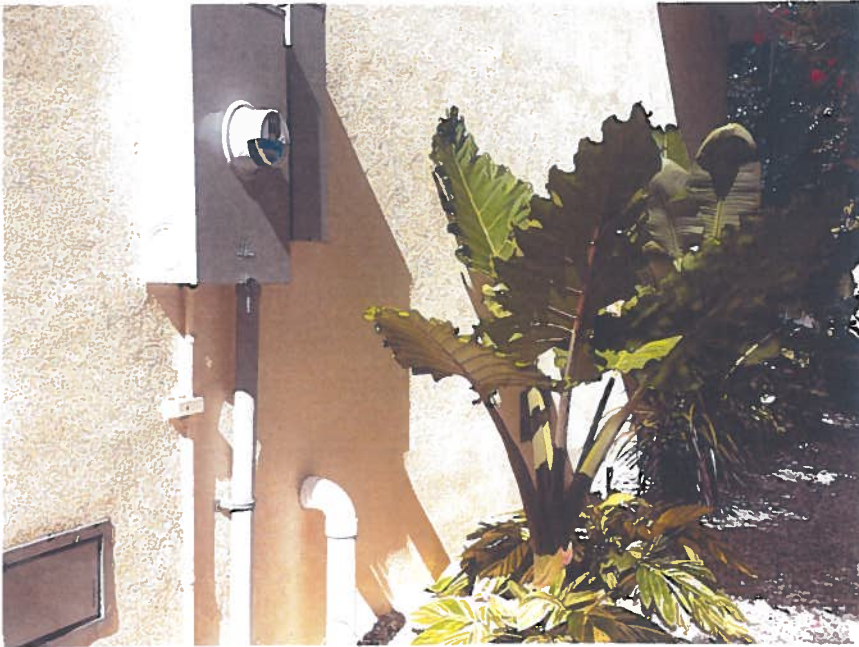
N O R T H S I D E V I E W July 21, 2015