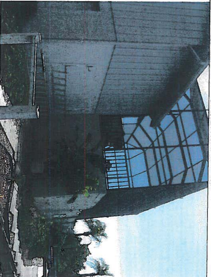
REAR VIEW 04/17/17