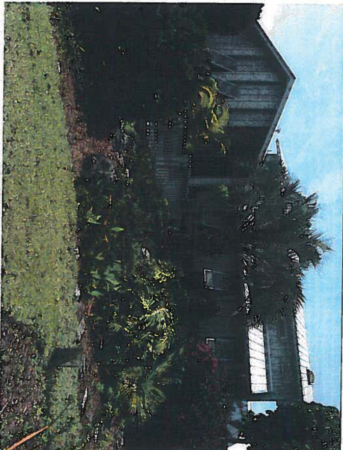
FRONT VIEW 04/17/17

If using the Elevation Certificate to obtain NFIP flood insurance, affix at least 2 building photographs below according to the instructions for Item A6. Identify all photographs with date taken; "Front View" and "Rear View"; and, if required, "Right Side View" and "Left Side View." When applicable, photographs must show the foundation with representative examples of the flood openings or vents, as indicated in Section A8. If submitting more photographs than will fit on this page, use the Continuation Page.