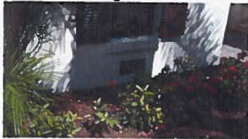
Vent 1 - Garage 1