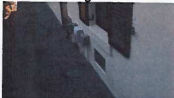
Vent 2 - Garage 1