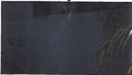
Vents 3 & 4 - North End of West Face of Garage 2